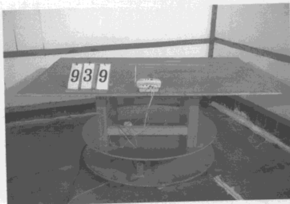
Fig 2 Rear View of the Test Configuration ( BASE )