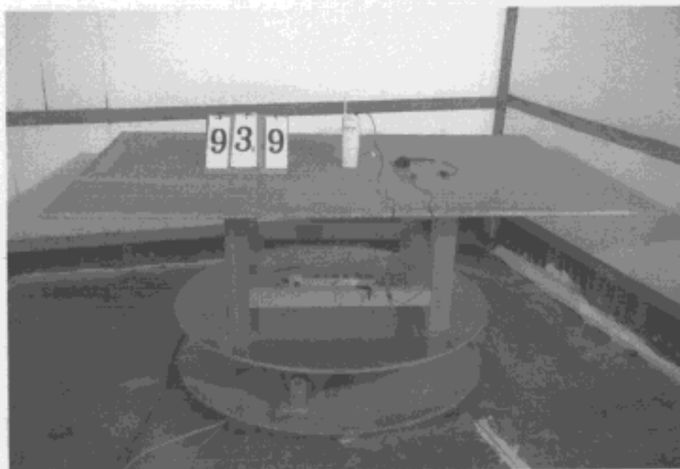
Pig 2 Rear View of the Test Configuration (HANDSET)

The test configuration for frequency between 1 GHz to 18 GHz is same as above.