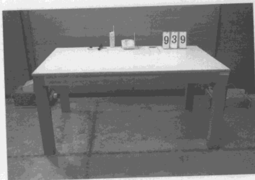
Fig. 4 Conducted emissions test placement (operating only)