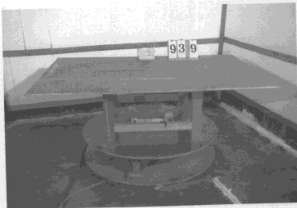
Fig 1 Front View of the Test Configuration ( BASE )