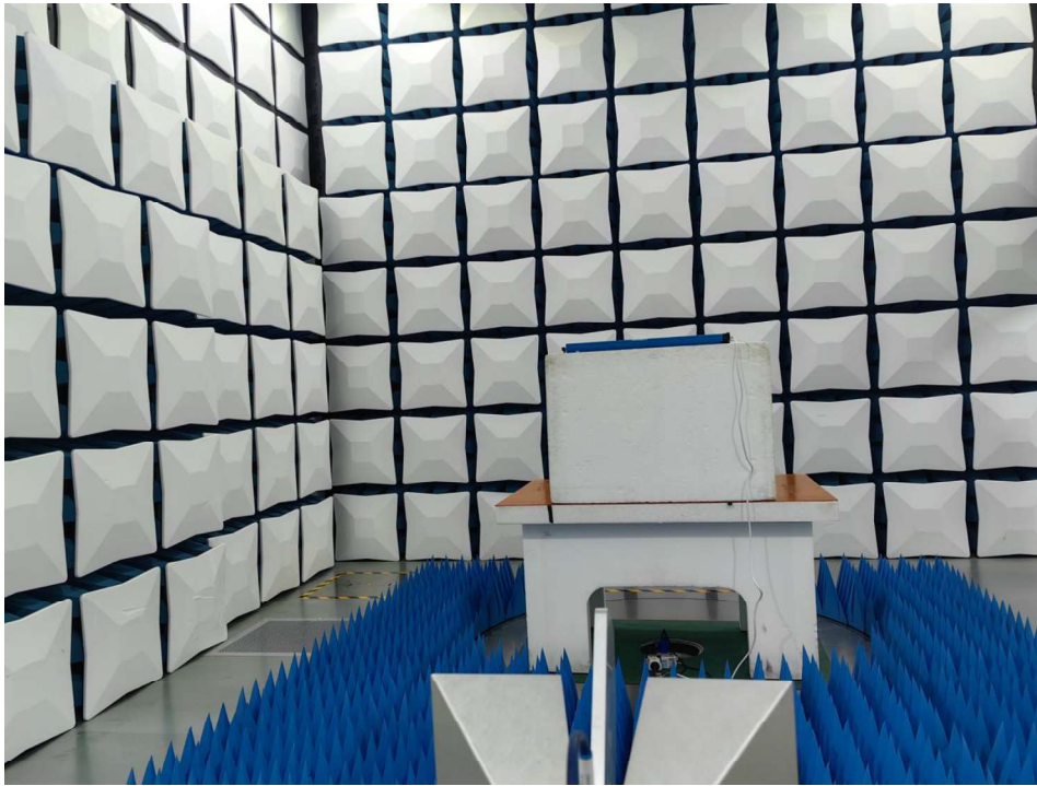
Test Set-up: Radiated spurious emission 1GHz-18GHz