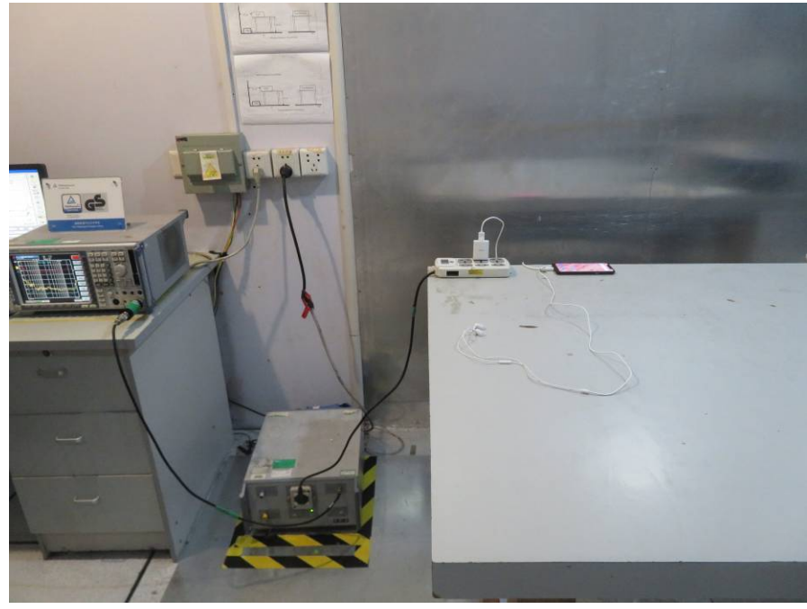
RADIATED EMISSION TEST (Frequency from 30MHz to 1GHz)