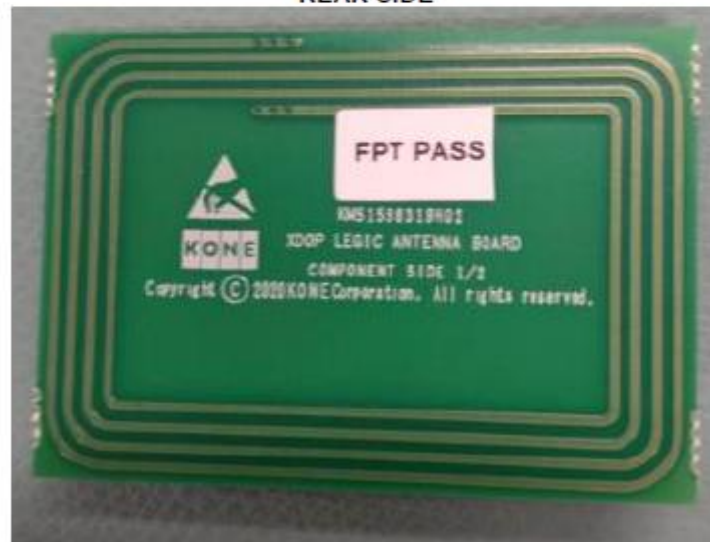
RFID Legic Antenna