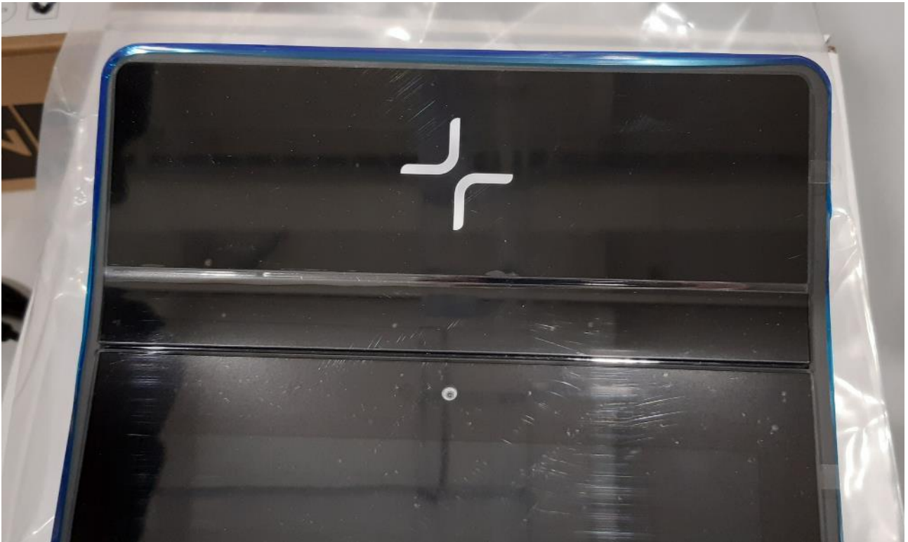
KSP 1068 -L Access glass closed