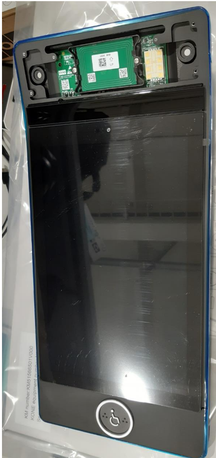
KSP 1068 -L