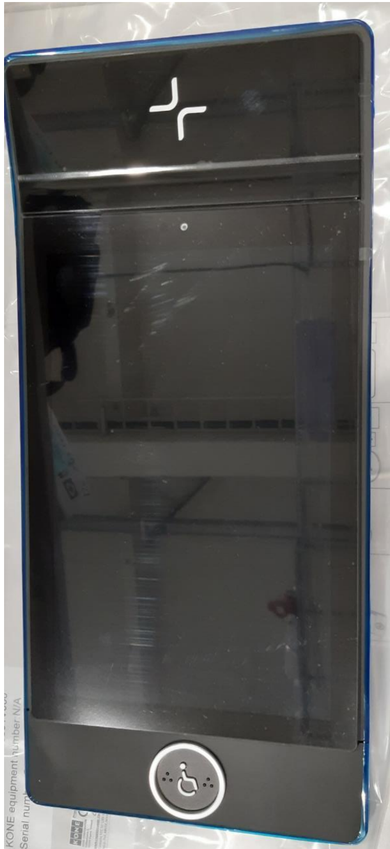
KSP 1068 -L