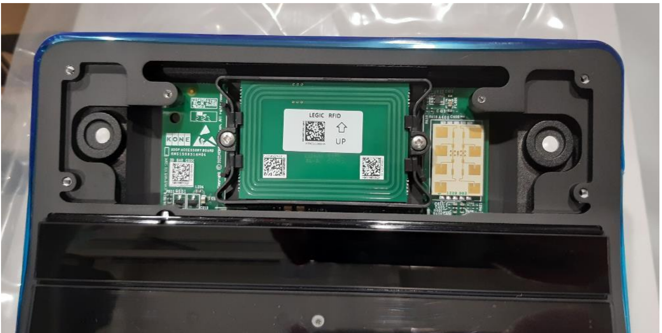
KSP 1068 -L Access glass removed

(Top side of the "KSP Access module" visible behind aluminum frame in -L Legic configuration)