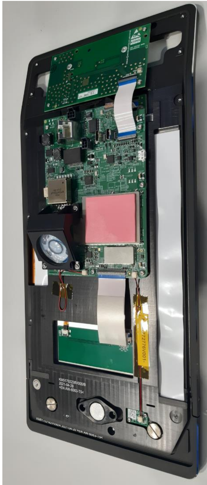
KSP 1028 -L