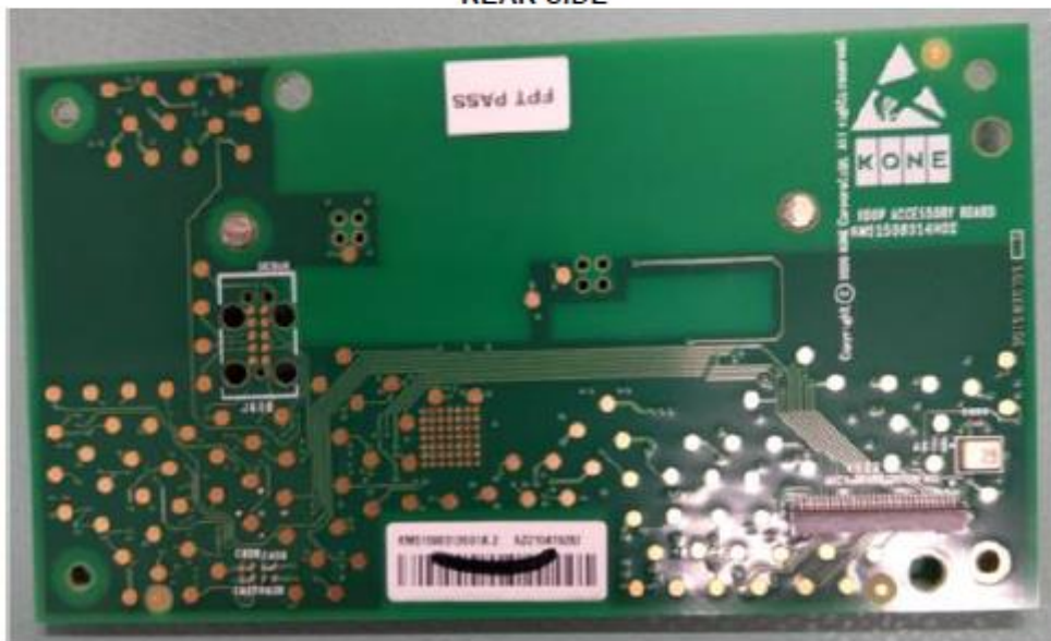
KSP Access Module