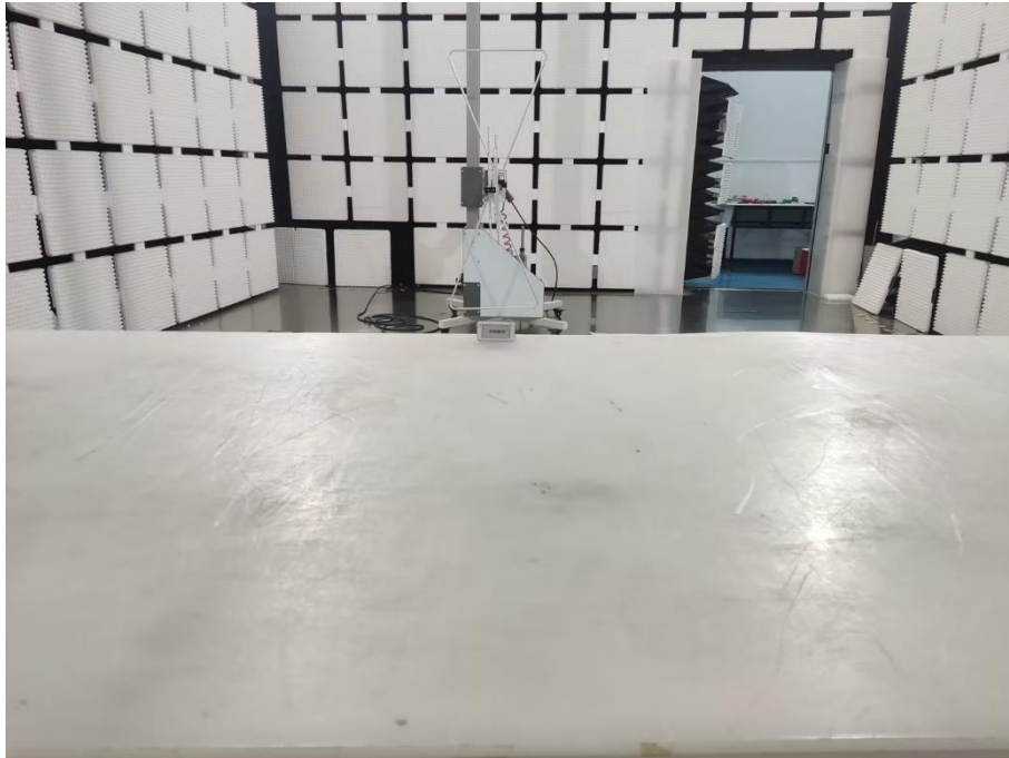
30MHz - 1GHz