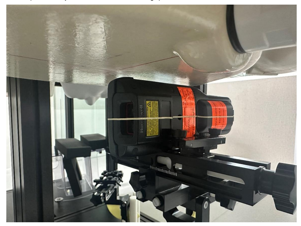
Description: Extremity Left Position with 0mm gap

Description: Body Left Position with 5mm gap