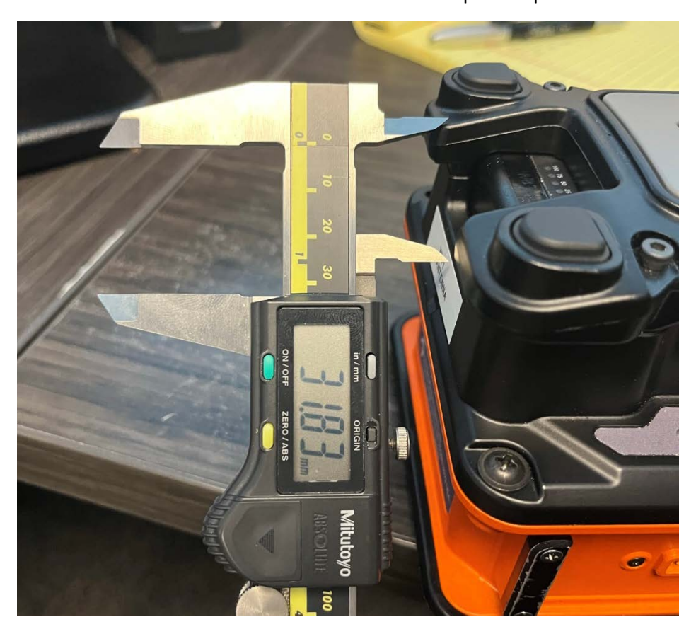
This image shows a typical use case for this device.

The distance from the center of the antenna to the tip of the piece where the button sits is approximately 32mm.