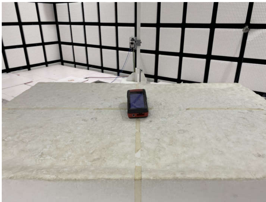
Radiated spurious emission Test Setup-3(18-30 GHz)