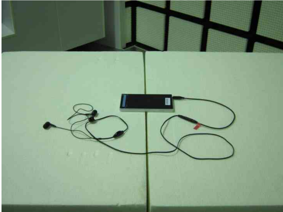
– X-axis –