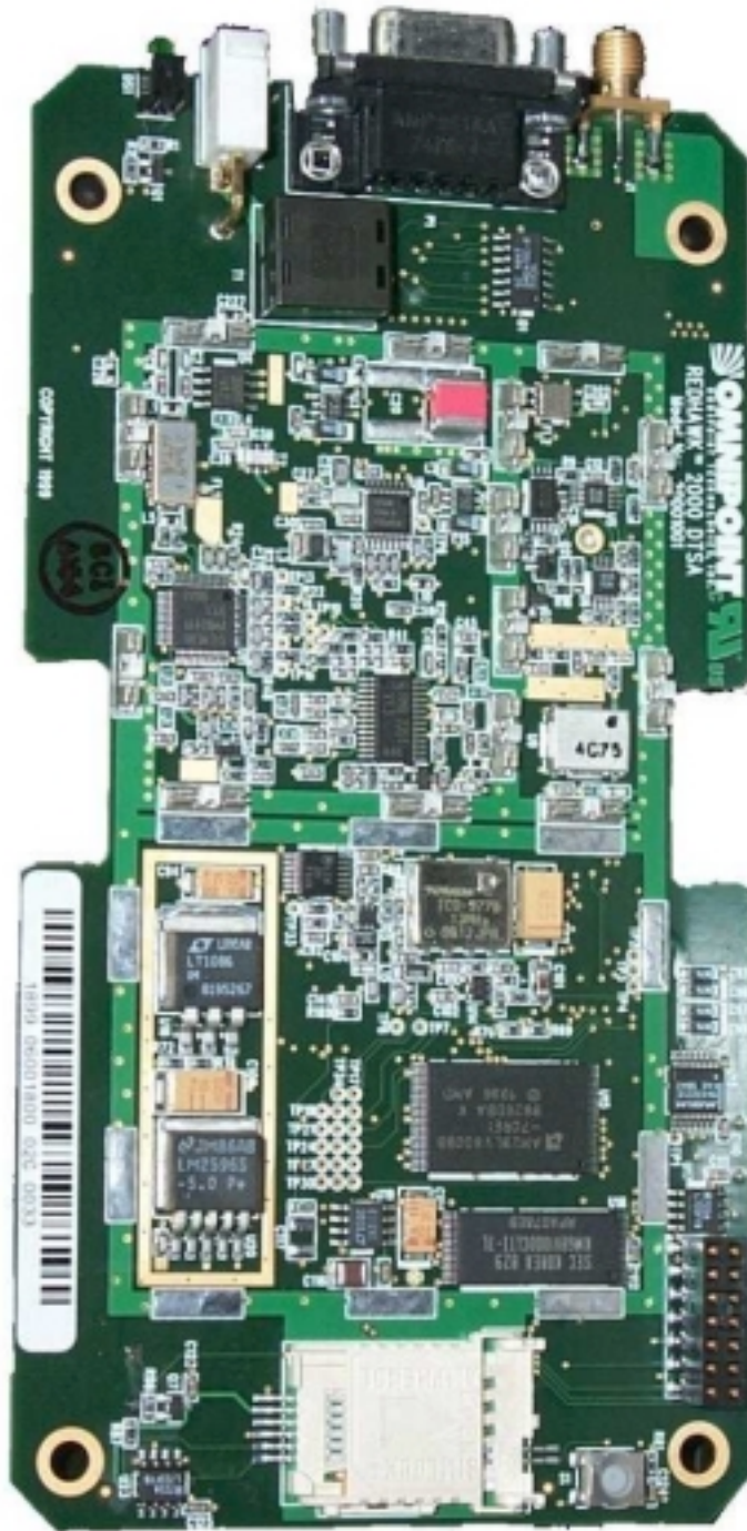
Photo 3. Top of DTSA PCB with RF shields covering radio circuitry removed