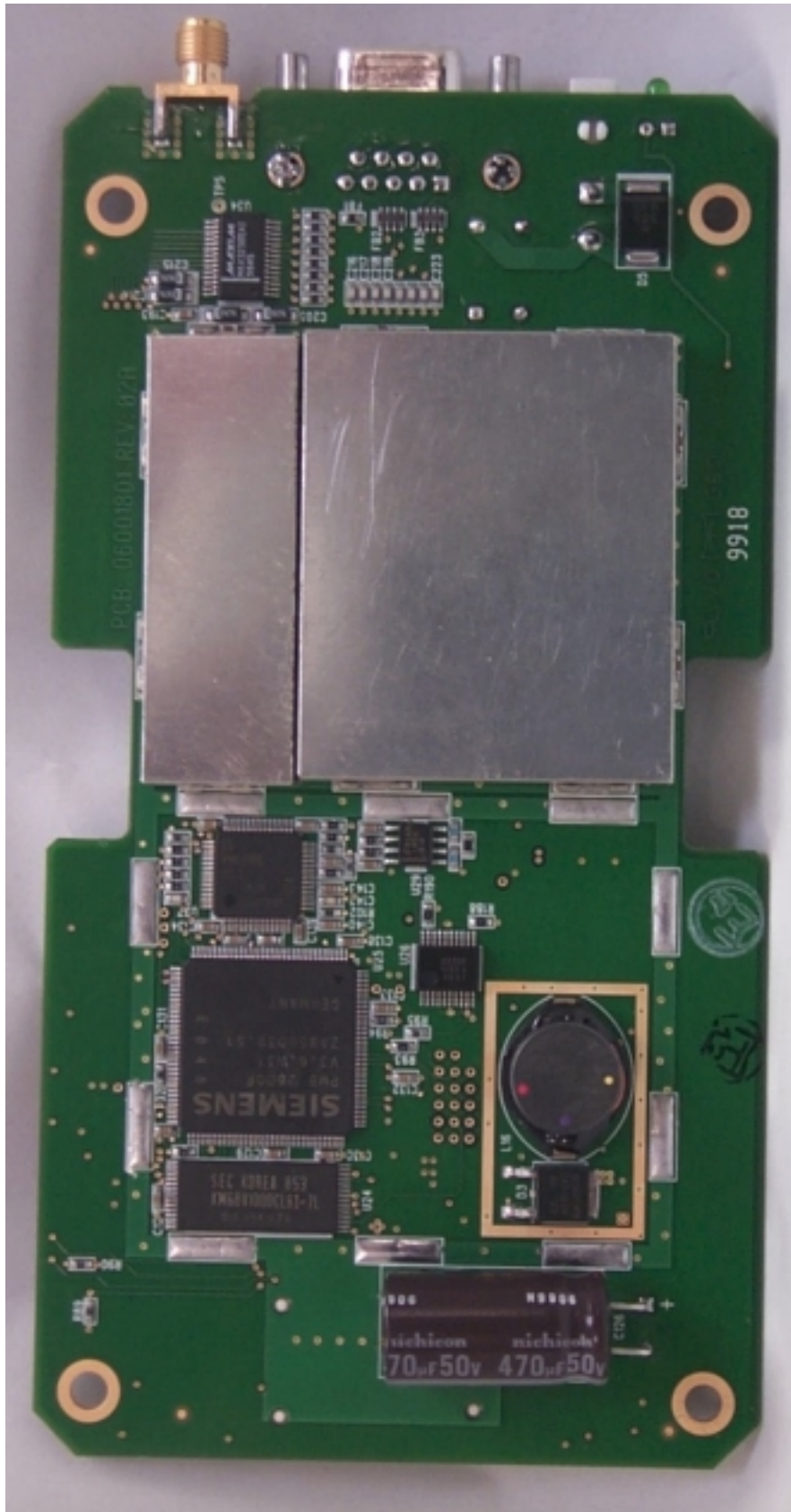
Photo 2. Bottom of DTSA PCB.