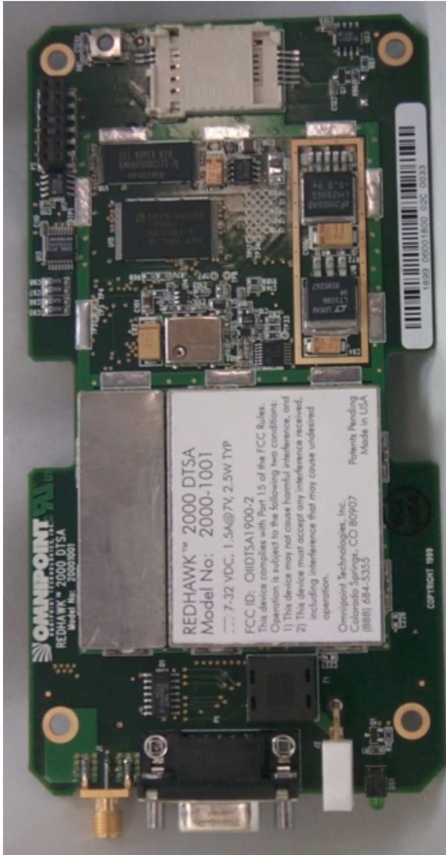
Photo 1. Top of DTSA PCB.