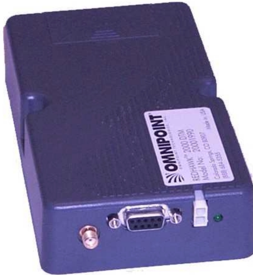
Photo 5. Overview of DTM.