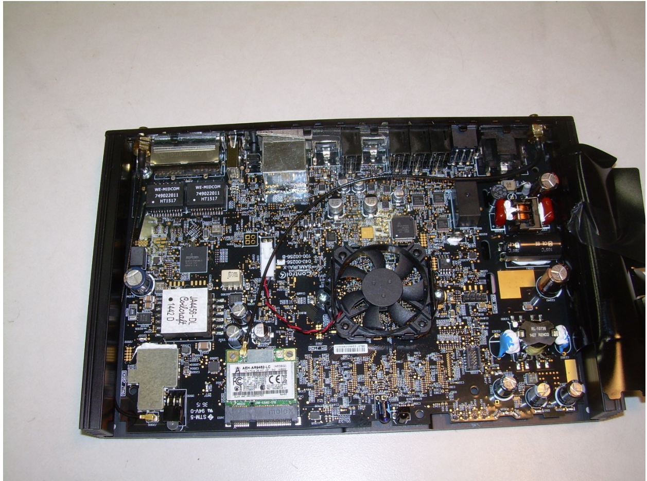
View of the Top Side of the PCB