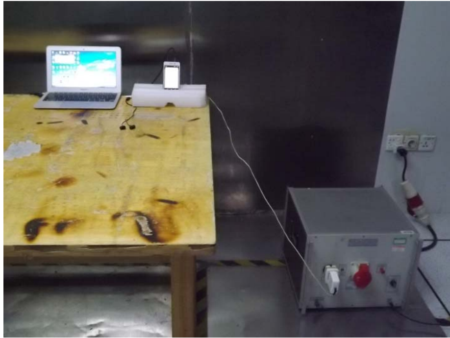
Photograph – Radiated Emission Test Setup for 30~1000MHz at Test Site 2#