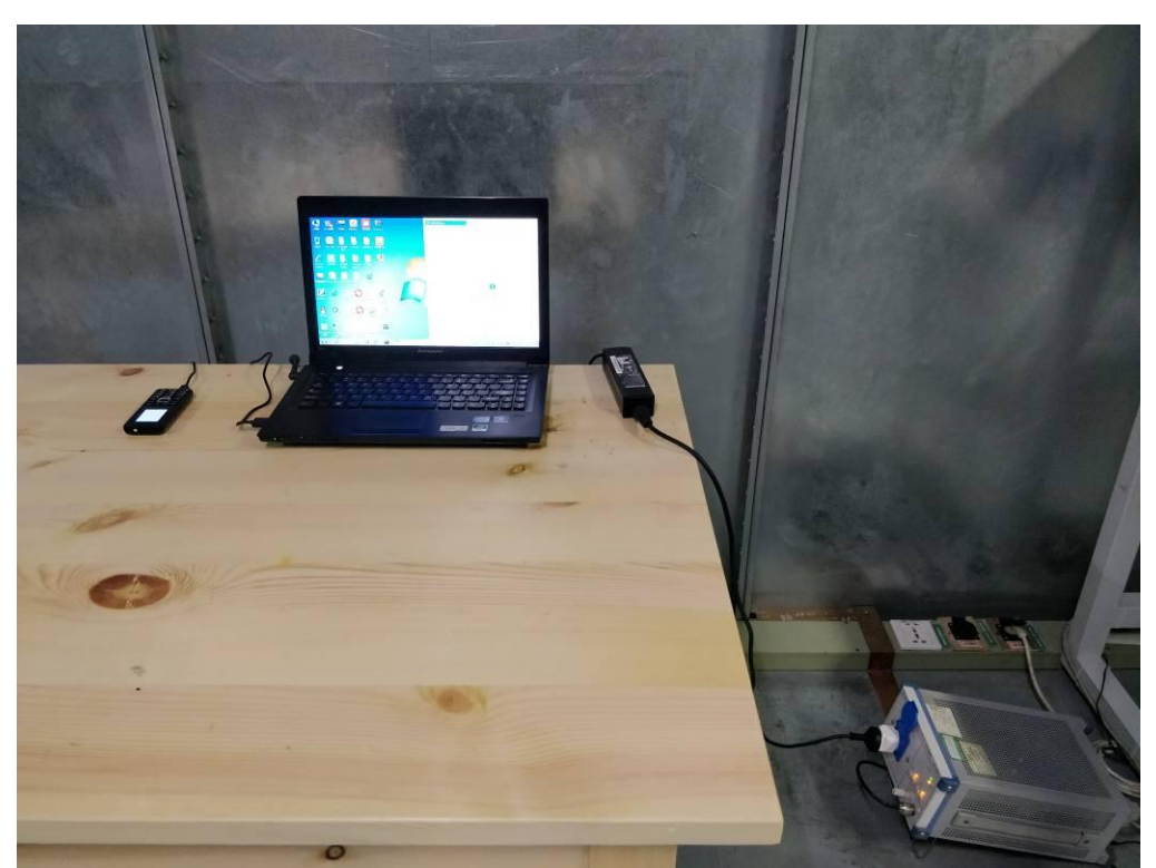
AC Conducted Emission of charge from PC mode

This report shall not be reproduced except in full, without the written approval of Shenzhen LCS Compliance Testing Laboratory Ltd.. Page 2 of 2