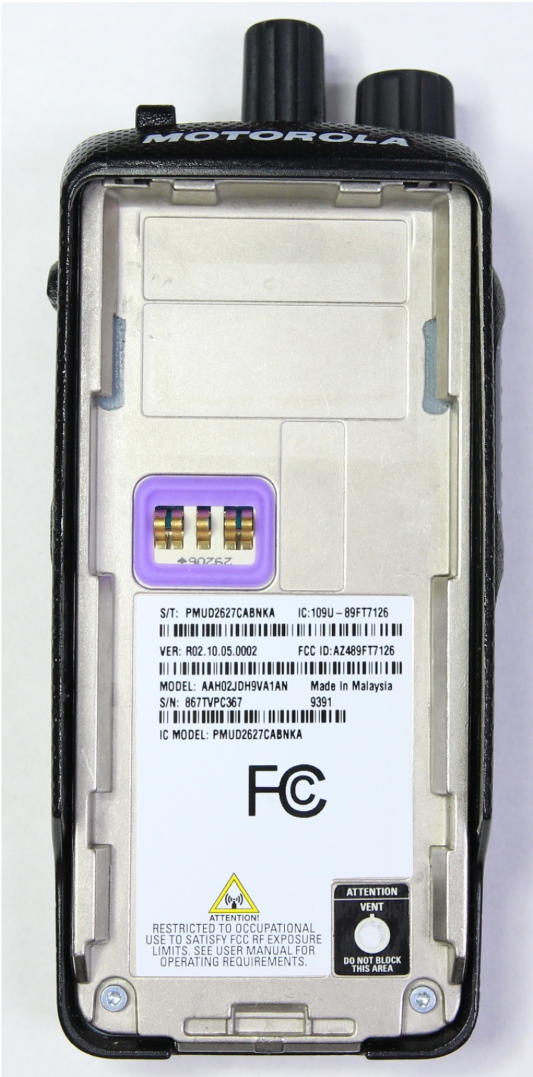
Back View for Limited Keypad and Plain Model (FCC label) – XPR 3500e & XPR 3300e