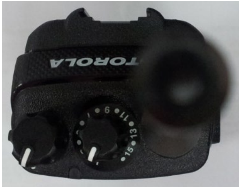
Top View for Limited Keypad and Plain Model (with Antenna) – XPR 3500e & XPR 3300e