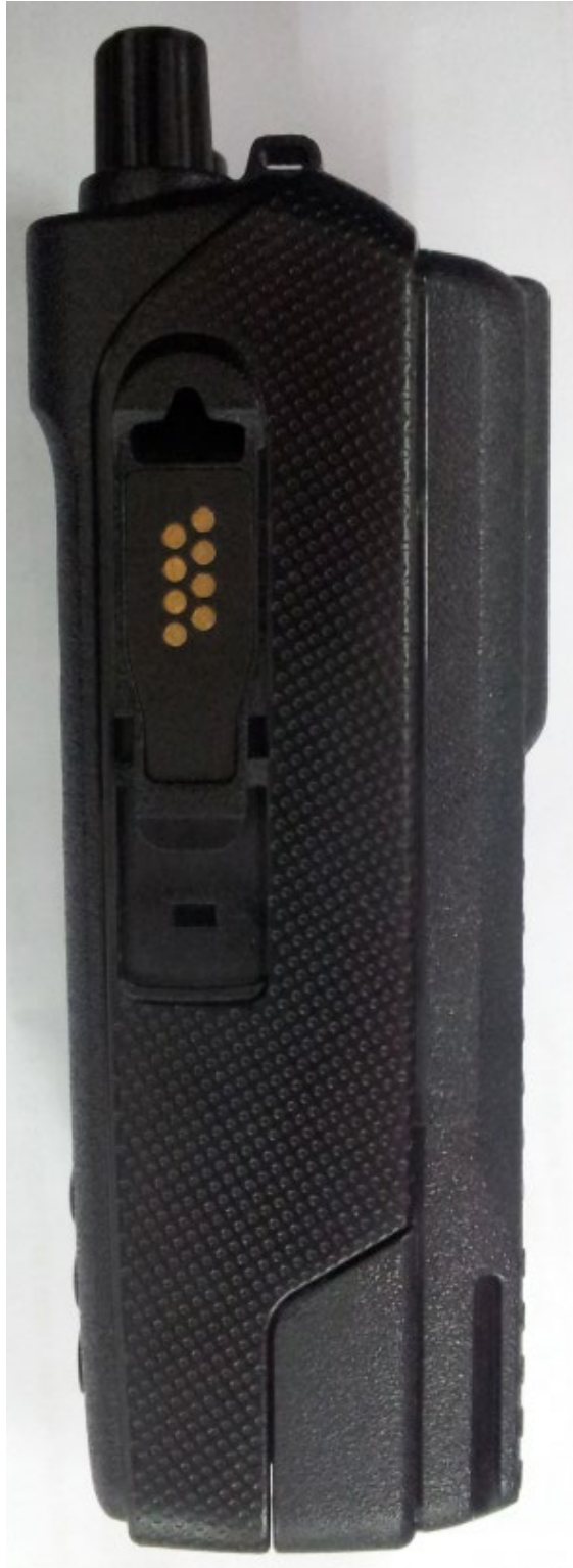
Side View for Limited Keypad and Plain Model (Right) – XPR 3500e & XPR 3300e