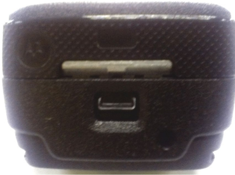
Bottom View with Battery for Limited Keypad and Plain Model - XPR 3500e & XPR 3300e