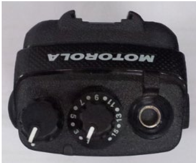
Top View for Limited Keypad and Plain Model (without Antenna) – XPR 3500e & XPR 3300e