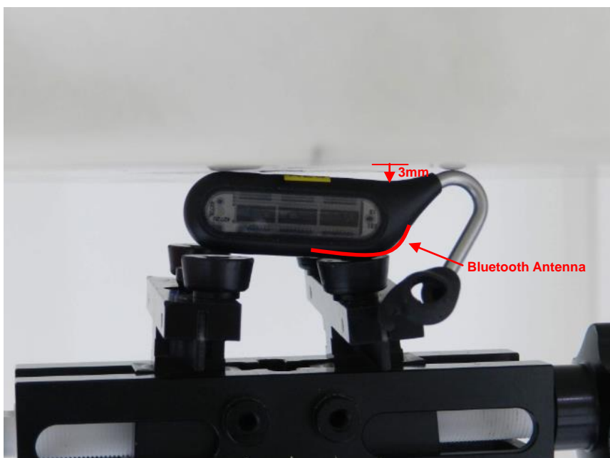
Right side (Flat phantom), additional separation introduced by the contour against a surface of the Flat phantom is 3 mm

Note: Since the devices with form factors that do not conform to a flat phantom, and iron tube gets in the way of Right Side positioning, therefore the whole Right Side of Bluetooth headset was slant and touch the flat phantom for the SAR testing, additional separation introduced by the SAR peak location against to flat phantom is <5 mm and 1g reported SAR is relative low and <1.2W/kg, therefore, the back SAR test position is compliance with RF exposure requirement.