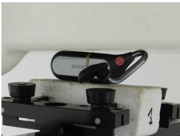
Right Side, Test Separation 0 mm