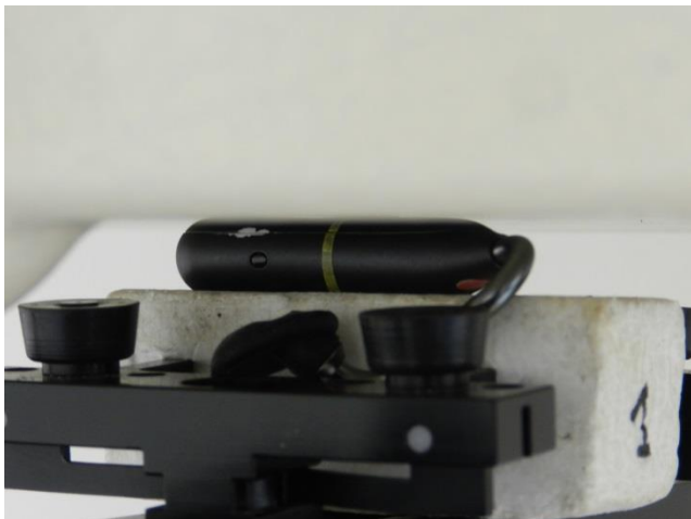
Bottom Face, Test Separation 0 mm