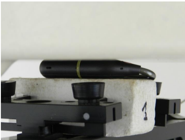
Front Face, Test Separation 0 mm