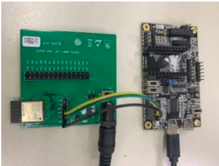
Figure 2: Hardware Connection