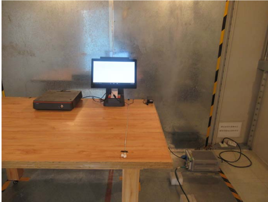
Conducted Emissions (Side View)