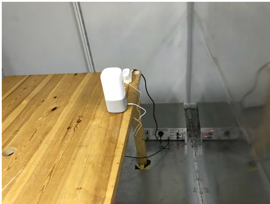
Conducted Emission Test 1