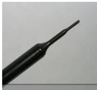
Interior of probe

Application: High precision dosimetric measurements in any exposure scenario (e.g., very strong gradient fields). Only probe which enables compliance testing for frequencies up to 6 GHz with precision of better 30%.