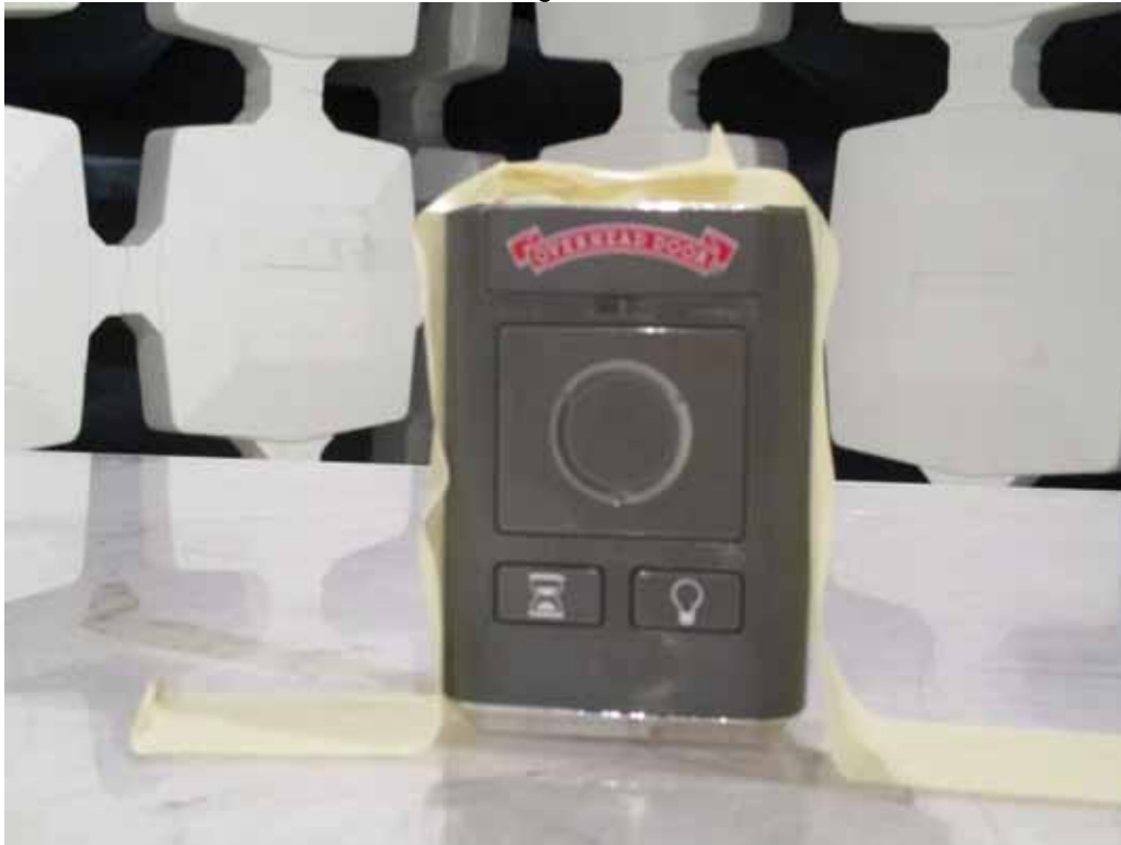
Photograph of the EUT