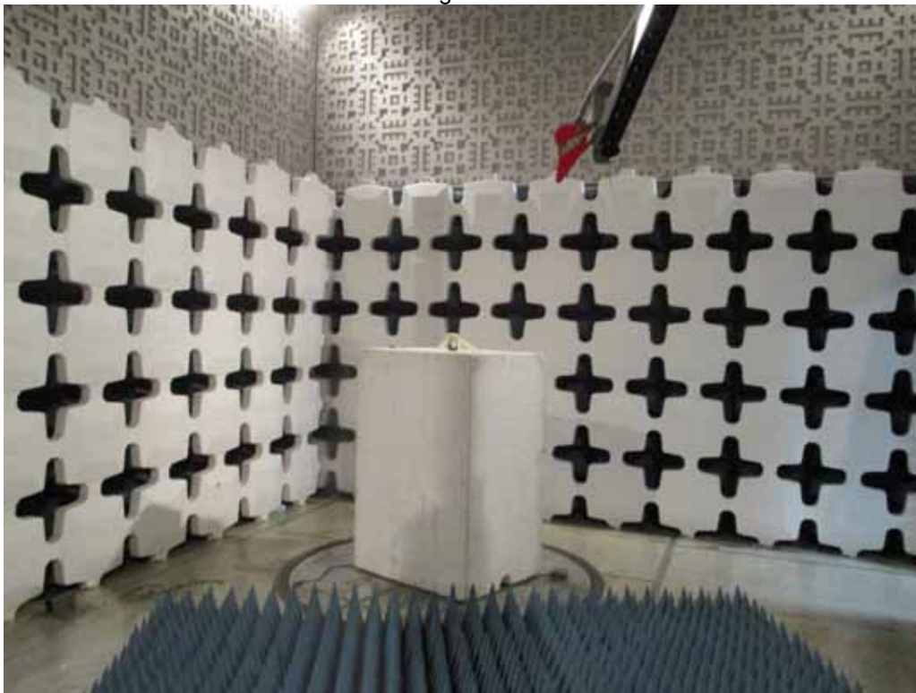
Test Setup for Radiated Emissions above 1GHz – Horizontal Polarization