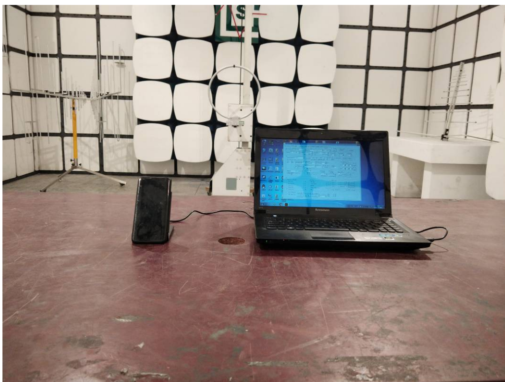
Radiated Emission below 30MHz-PC charge mode (Pad Mode)