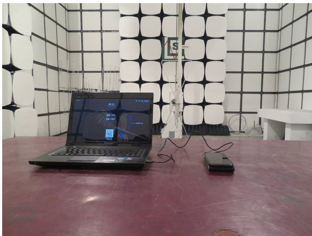
Radiated Emission below 1GHz-PC charge mode (Supine mode)