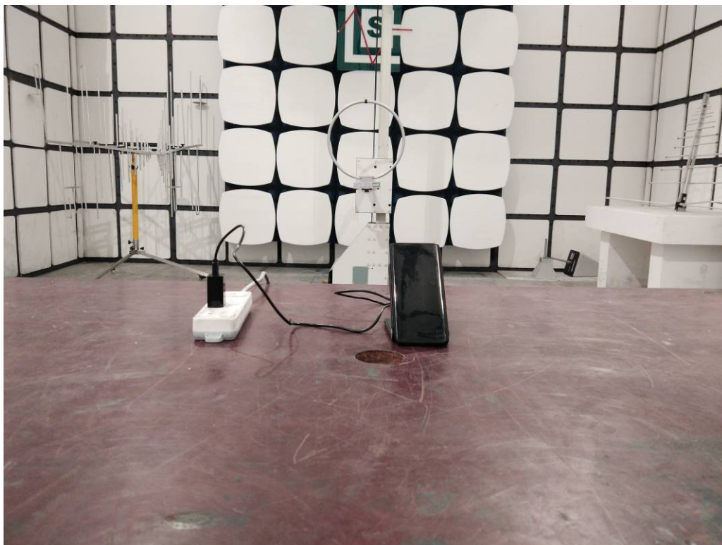
Radiated Emission below 30MHz-AC adapter charge mode (Pad Mode)