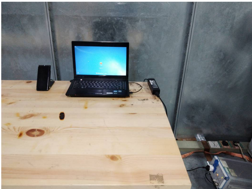
Conducted Emission-PC charge mode (Pad Mode)