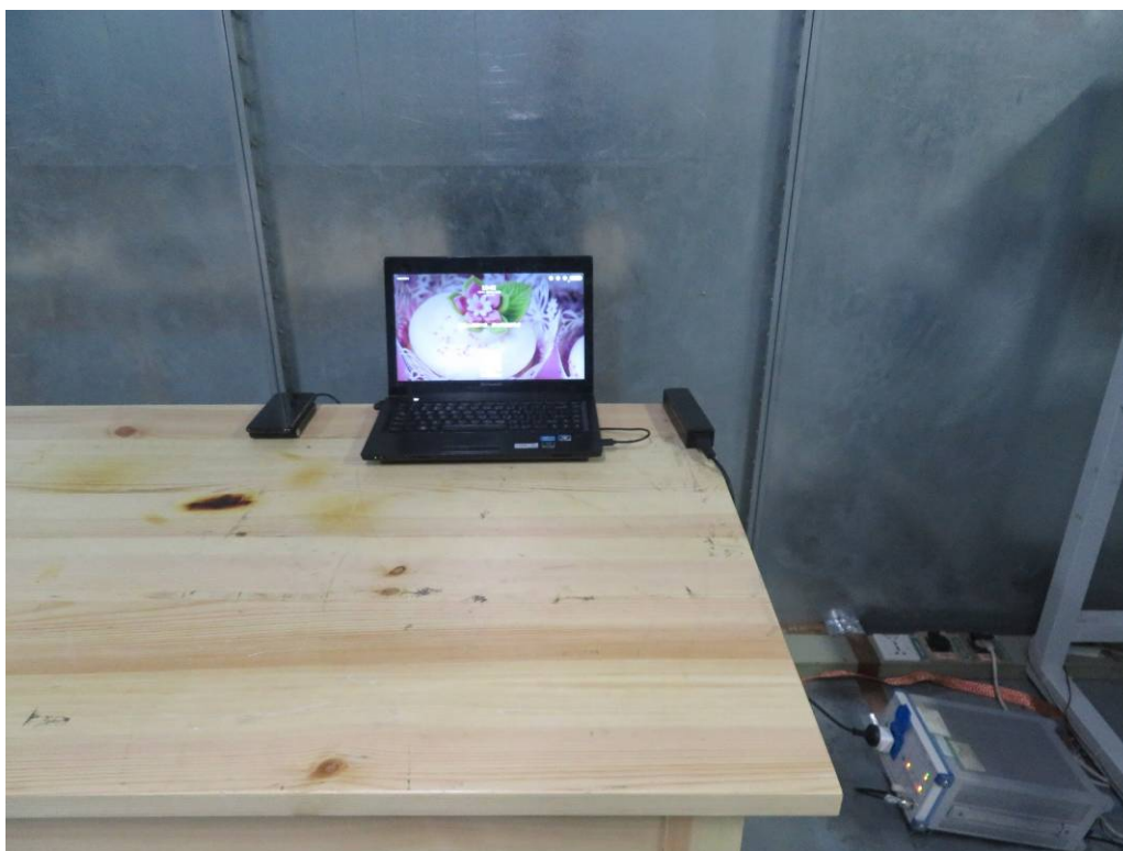
Conducted Emission-PC charge mode (Supine mode)