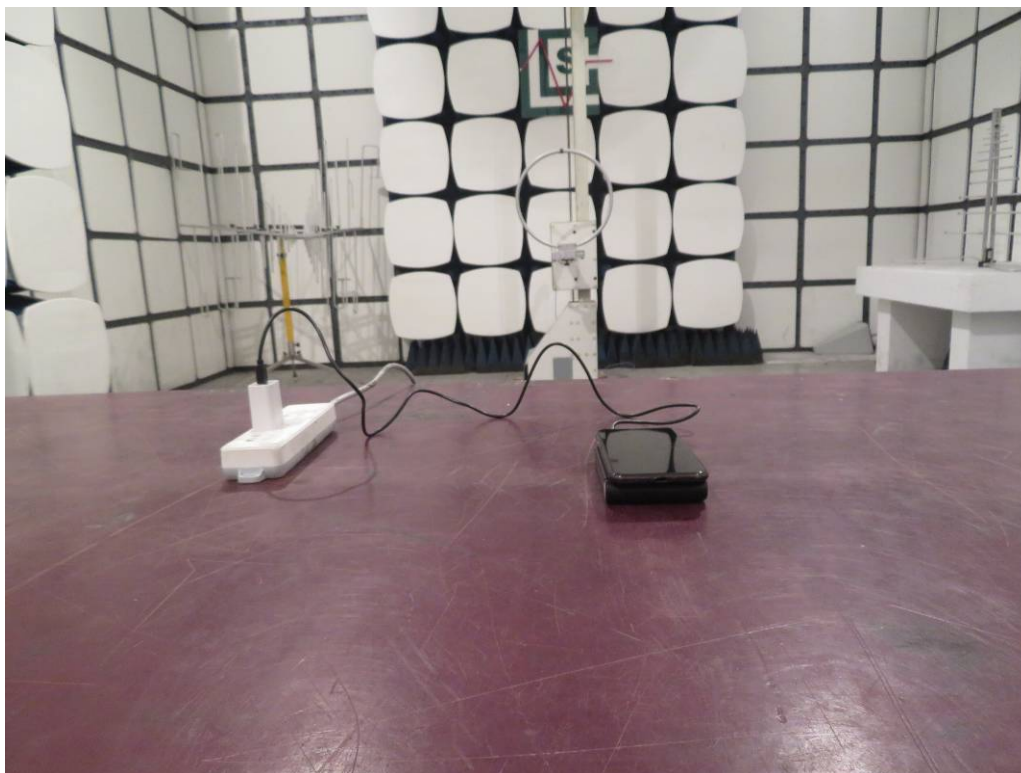
Radiated Emission below 30MHz-AC adapter charge mode (Supine mode)