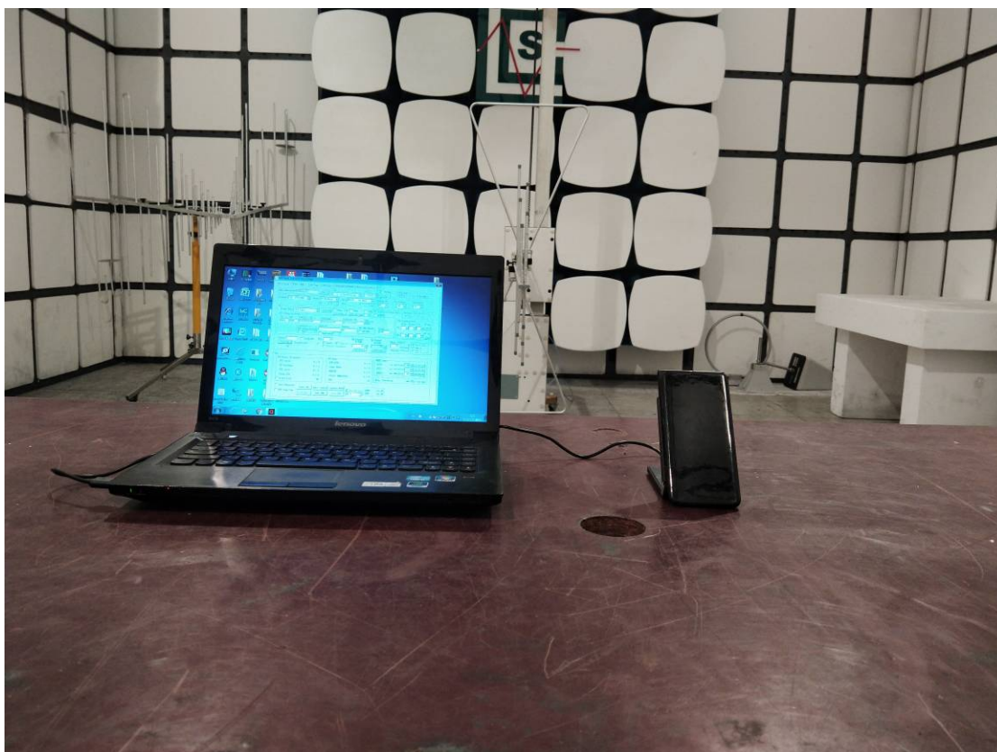
Radiated Emission below 1GHz-PC charge mode (Pad Mode)