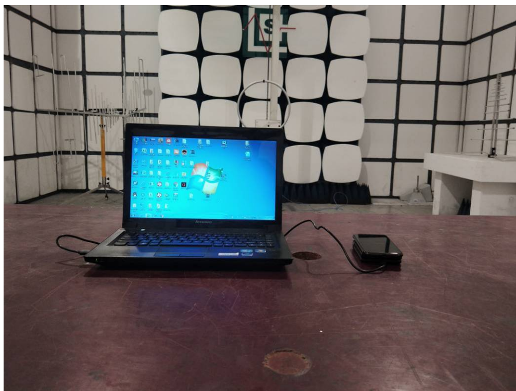
Radiated Emission below 30MHz-PC charge mode (Supine mode)