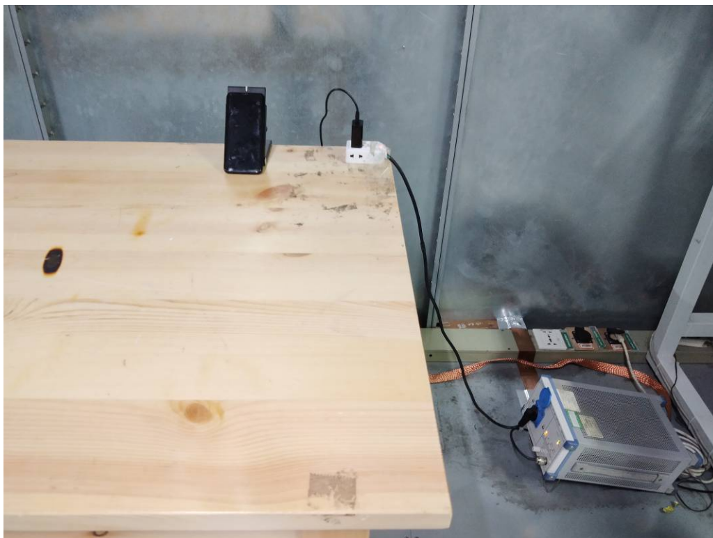
Conducted Emission-AC adapter charge mode (Pad Mode)