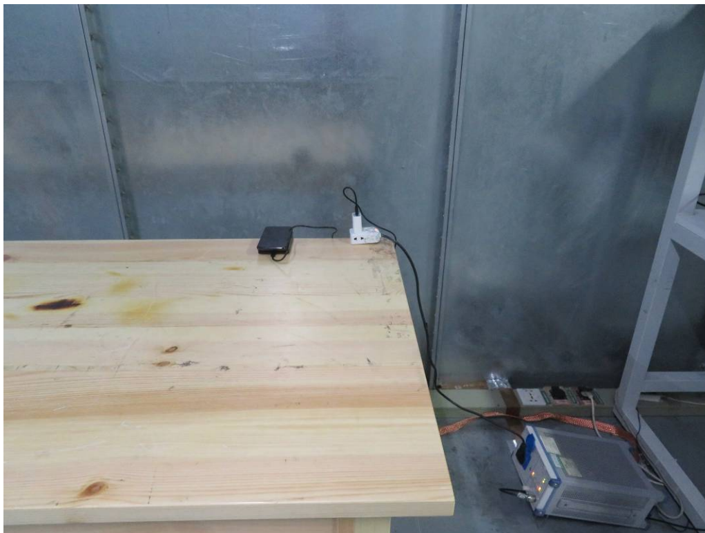
Conducted Emission-AC adapter charge mode (Supine mode)