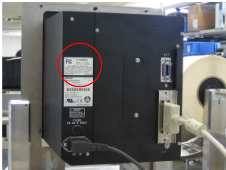
Label Position (Printer Back View)

Adhesive: Hot melt pressure sensitive adhesives, or Synthetic resin emulsion