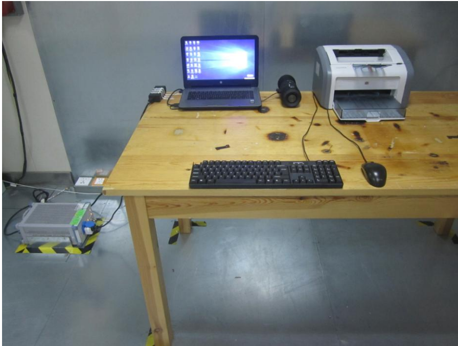
Conducted Measurement Photos