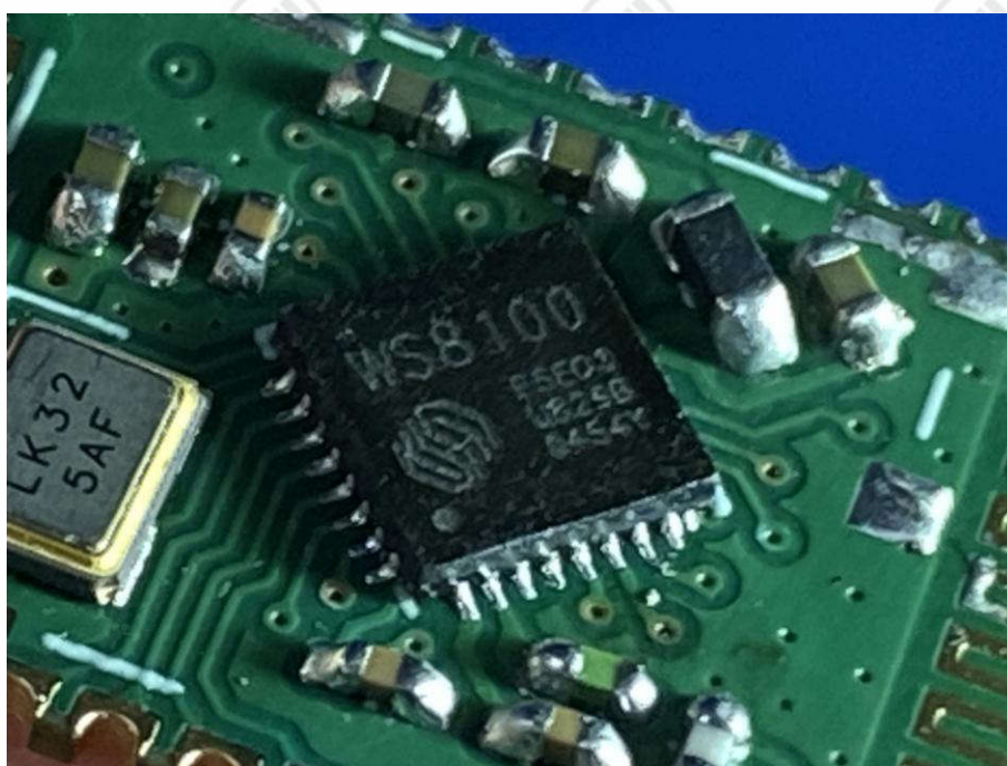
View of Product-6