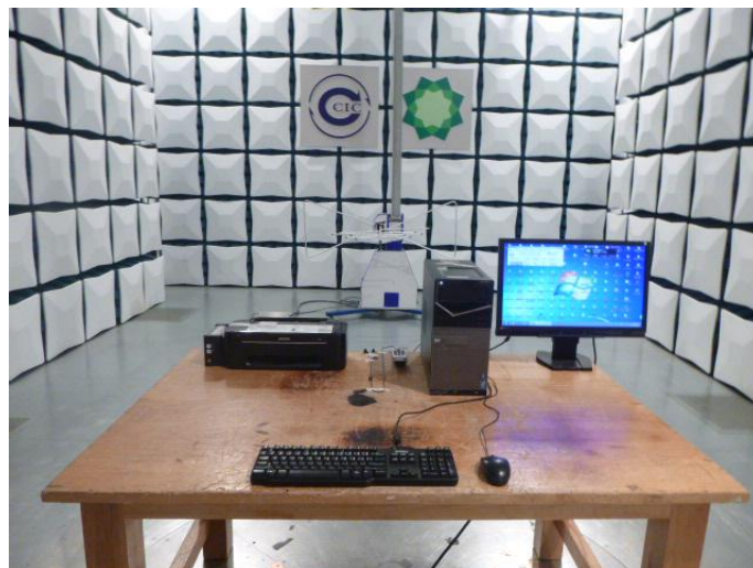
Radiated Emission (above 1GHz) Connect to PC