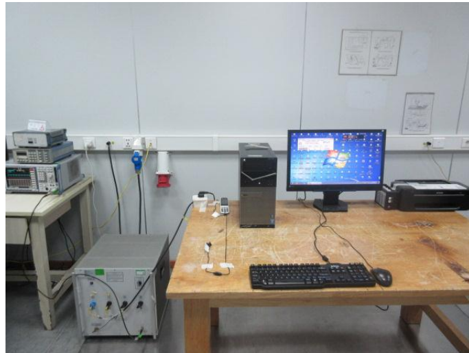
Radiated Emission (30MHz-1GHz) Connect to PC