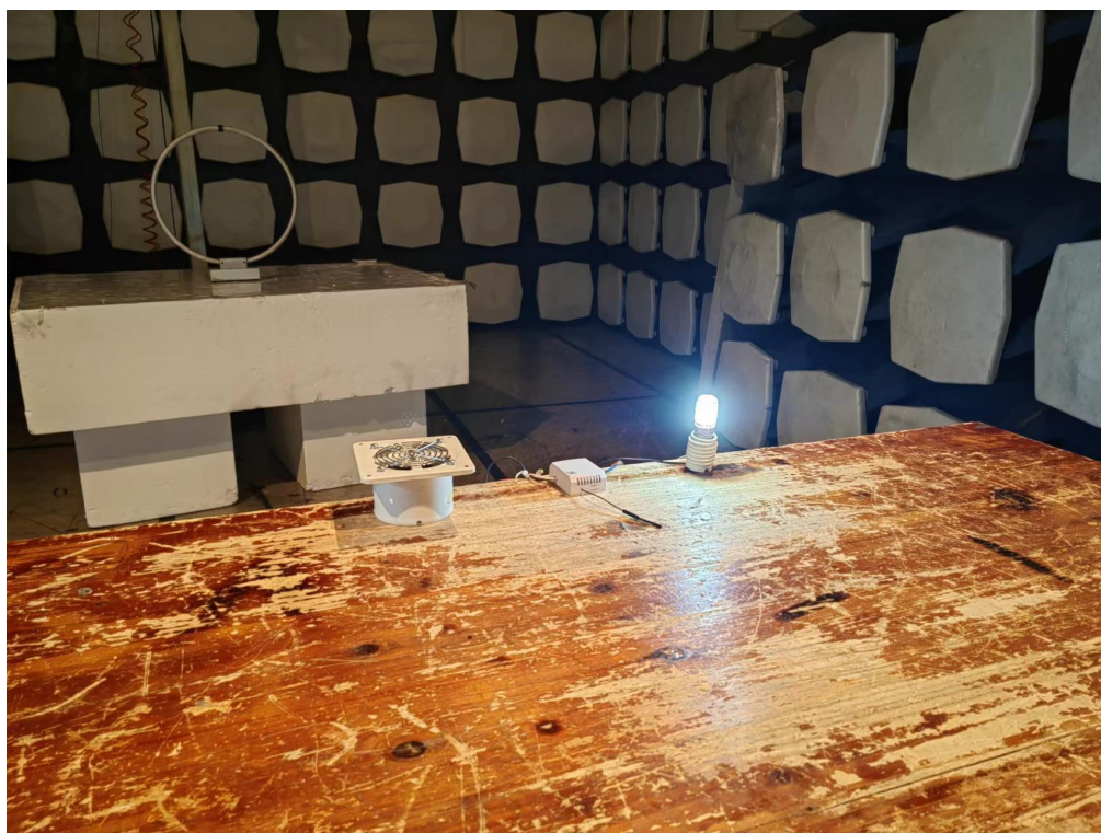
9kHz to 30MHz Radiated Spurious Emissions