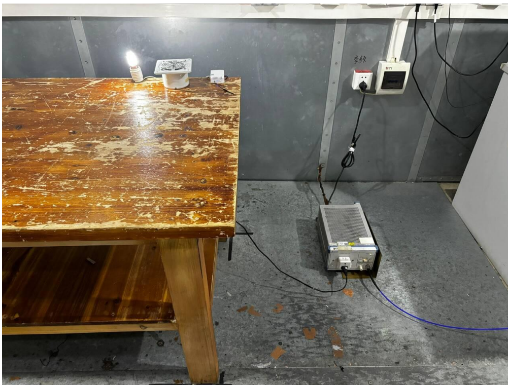
Conducted Emissions at Mains Terminals 150 kHz to 30 MHz