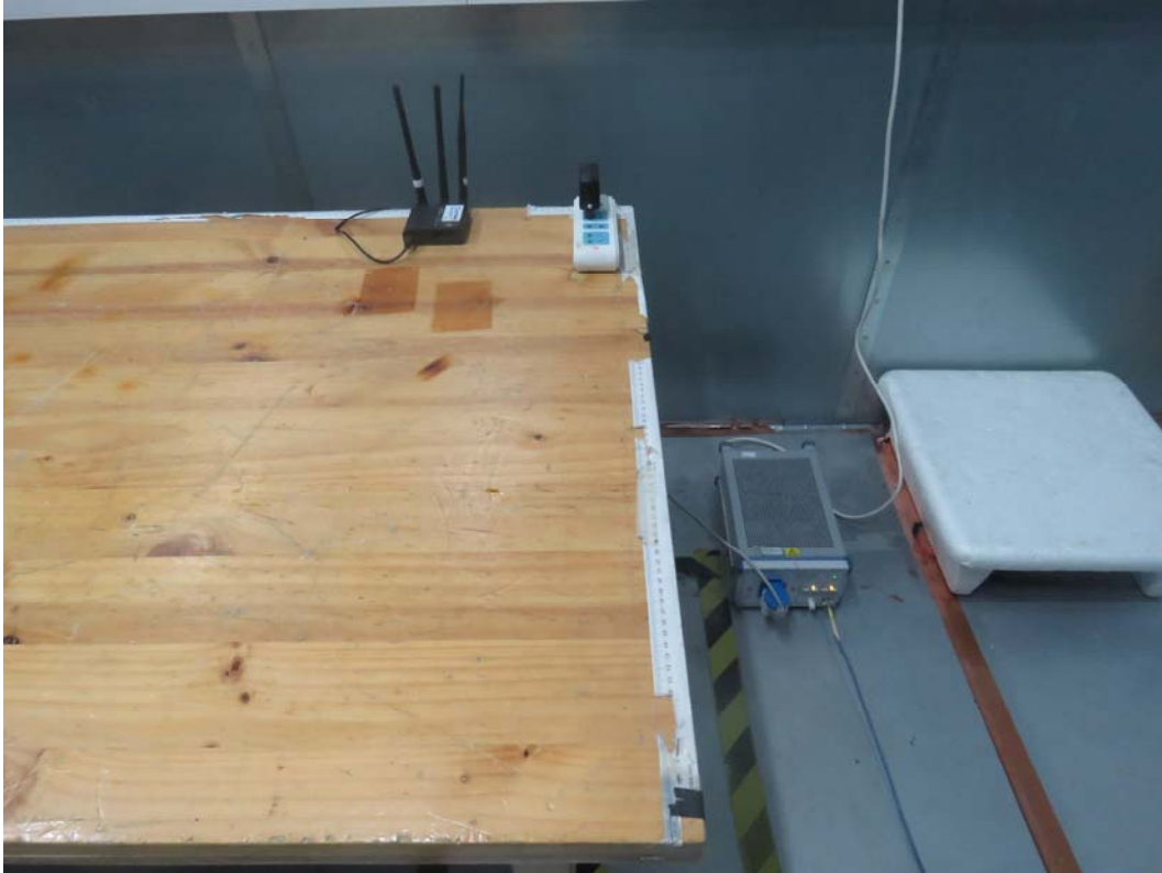
Picture 3 Conducted Emission Test Setup