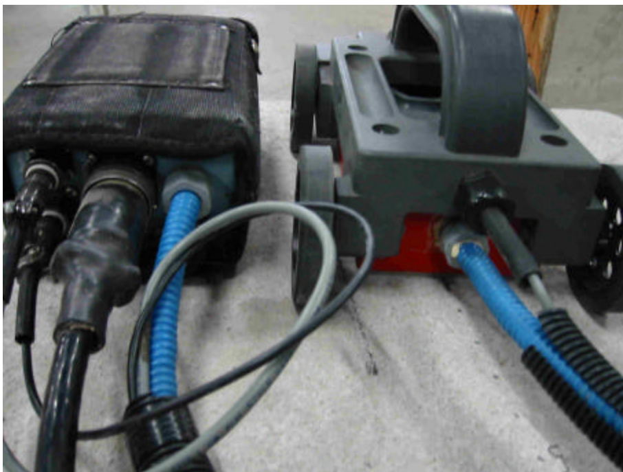
VIEW OF CONNECTORS