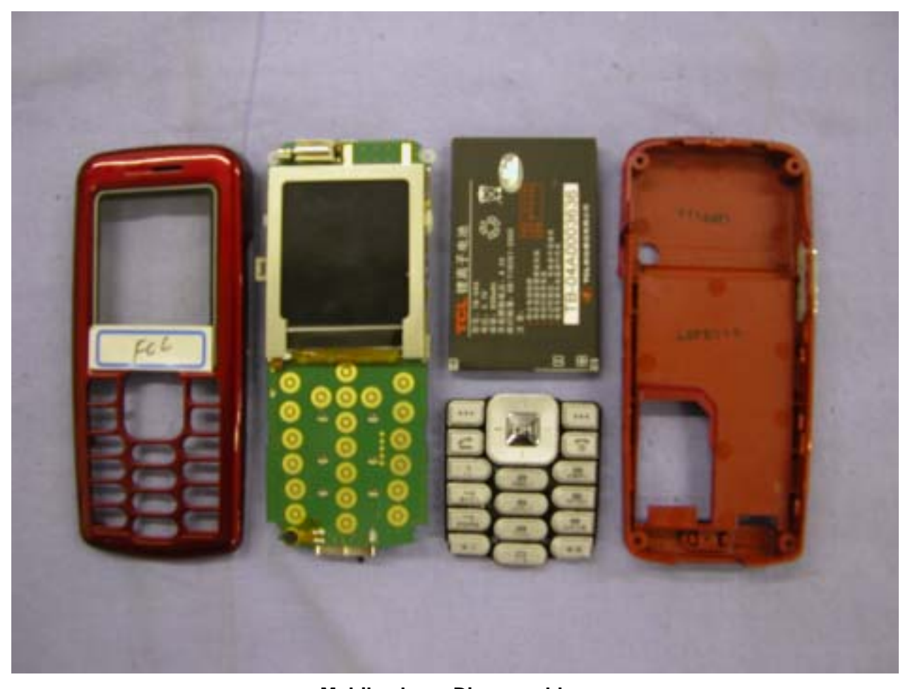
Mobile phone Disassembly