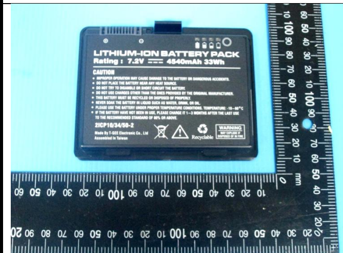
Battery – Front View