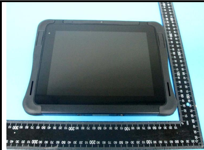
EUT – Front View