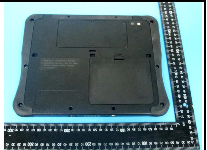
EUT – Rear View