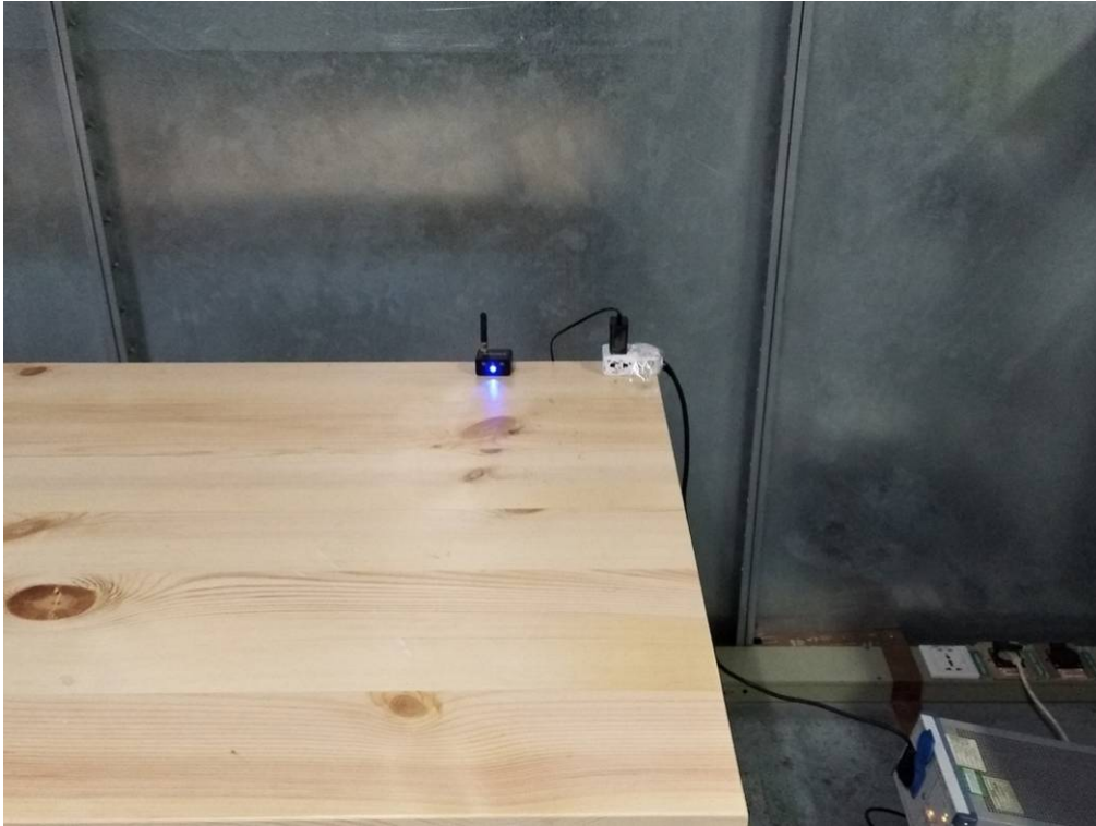
Conducted Emission-adapter mode