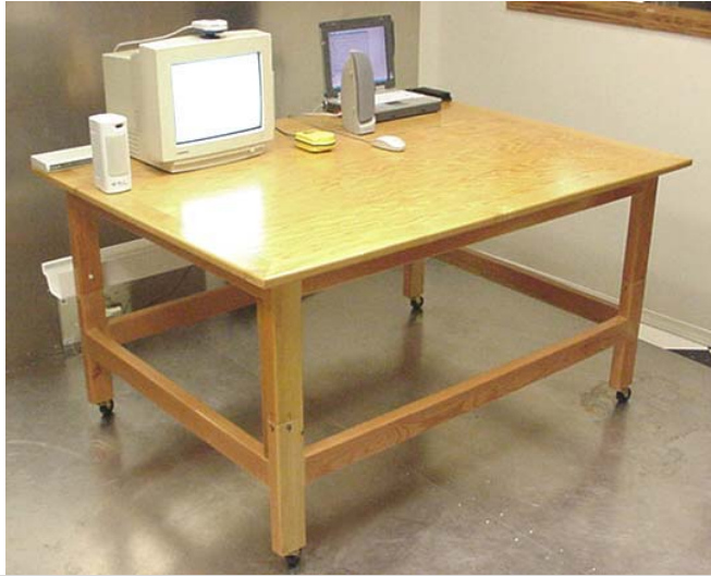
Photograph G-1 - AC Powerline Conducted Emission Configuration