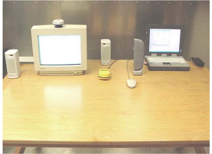
Photograph G-2 - AC Powerline Conducted Emission Cable Placement