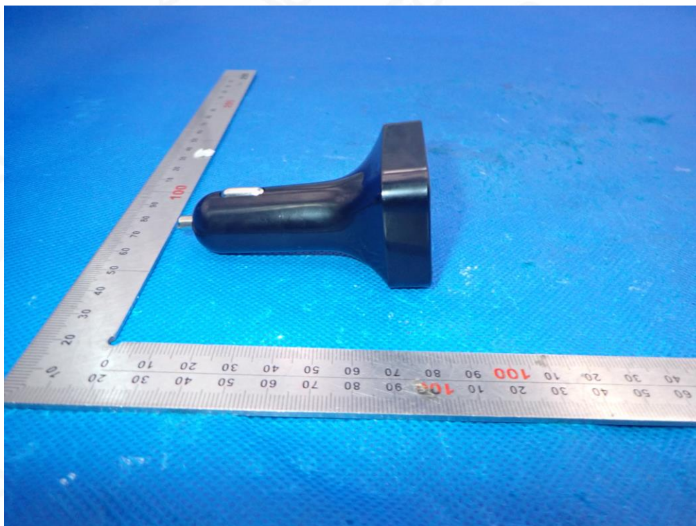
PORT VIEW OF EUT