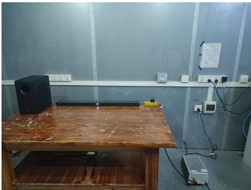
Conducted Emissions at Mains Terminals 150 kHz to 30 MHz