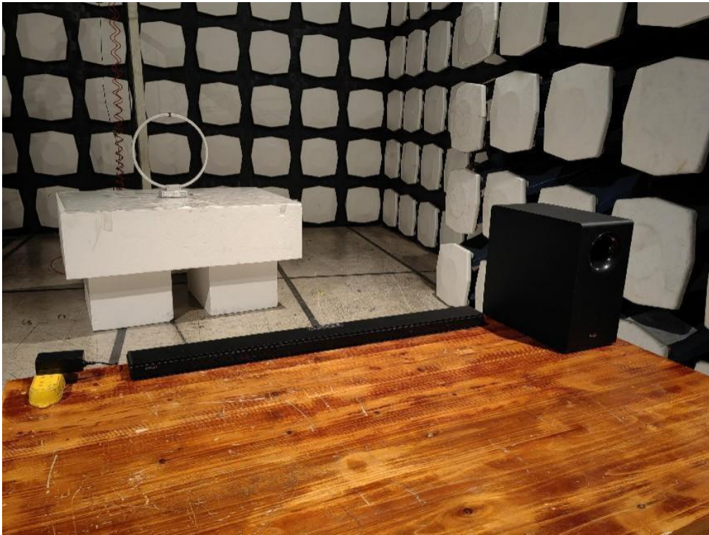
9kHz to 30MHz Radiated Spurious Emissions