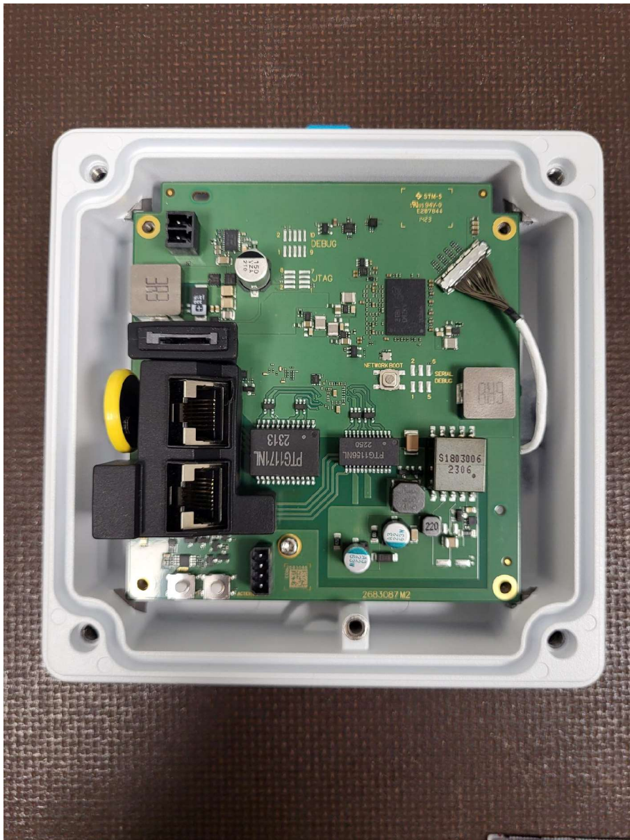
Back view of EUT and main PCB.