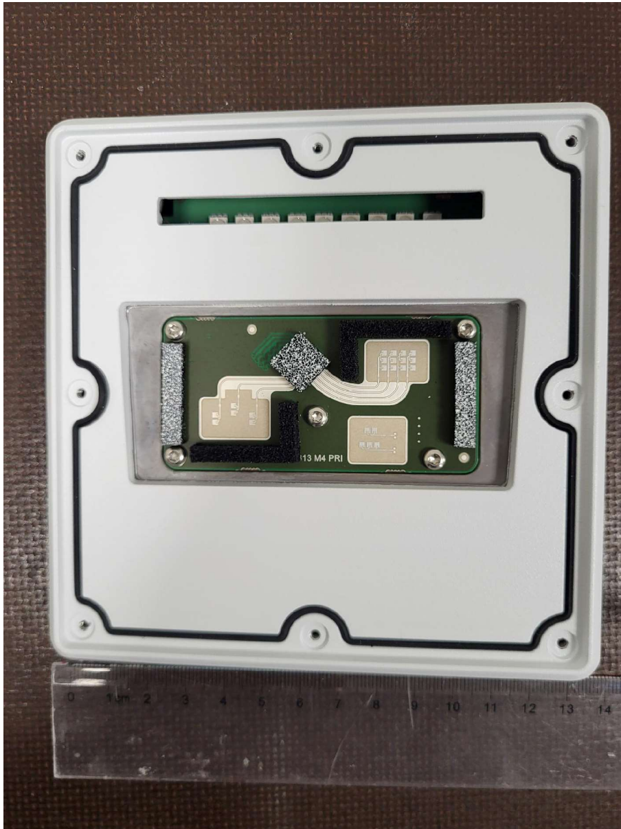
Front view of EUT and RF PCB without radome