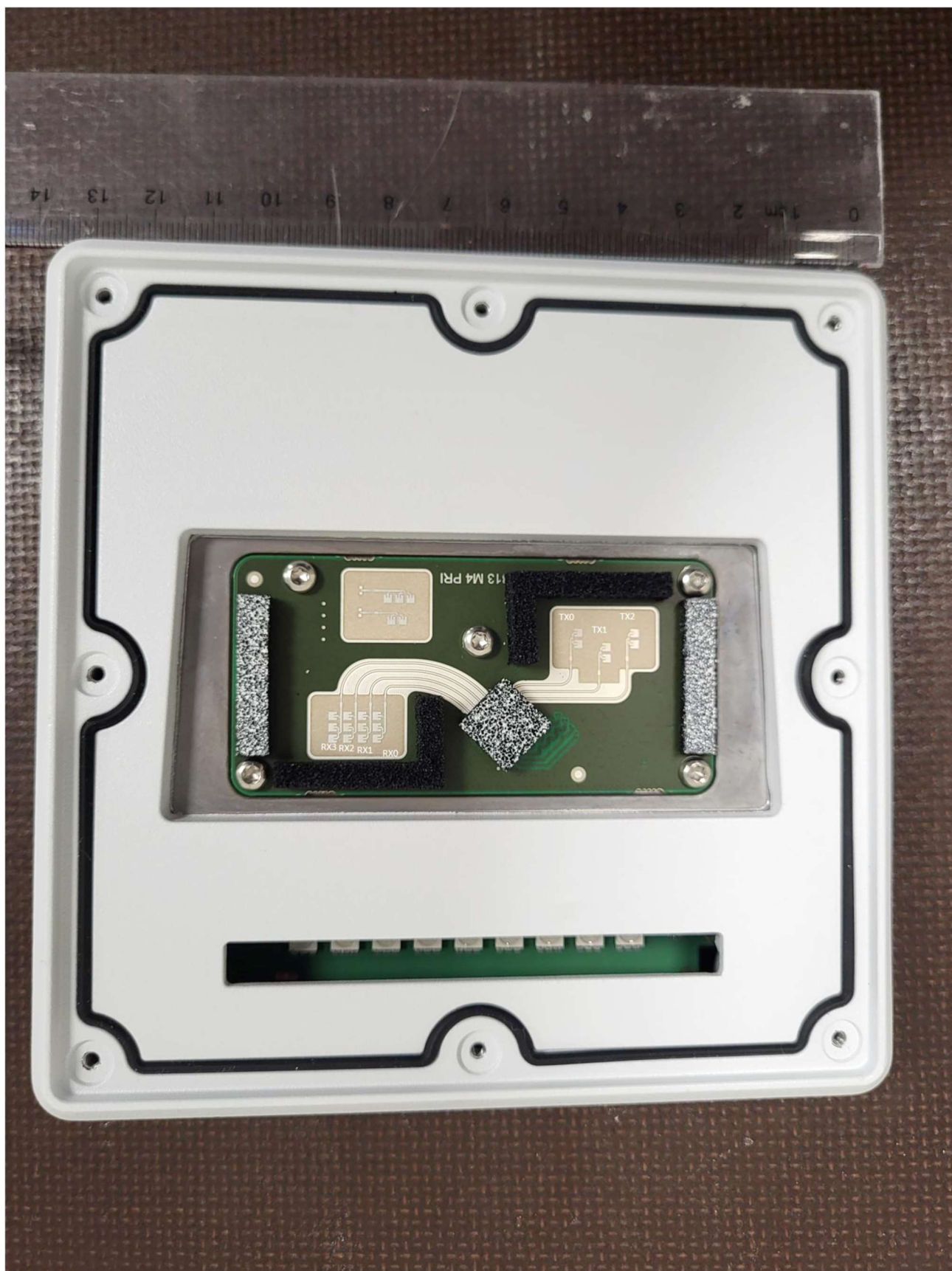
RF PCB with antenna labeling