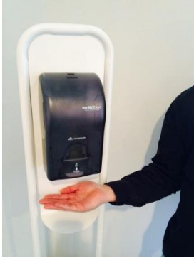
IT-373GPX shown integrated with a GP dispenser