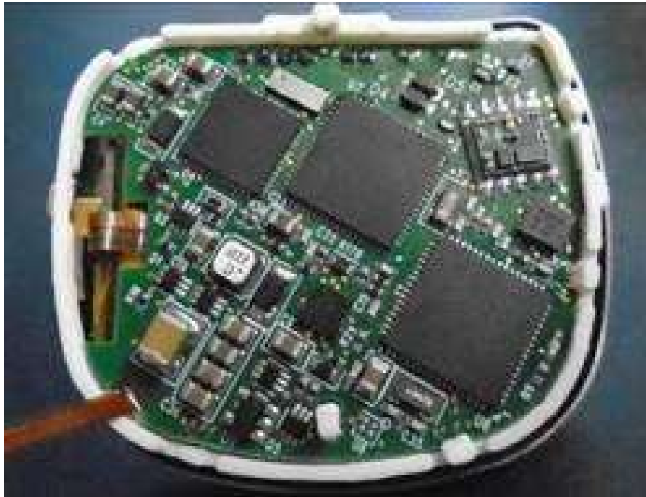
Internal Picture 1: PCB layout of the Optimizer Smart Mini in cannister during production, prior to header attachment