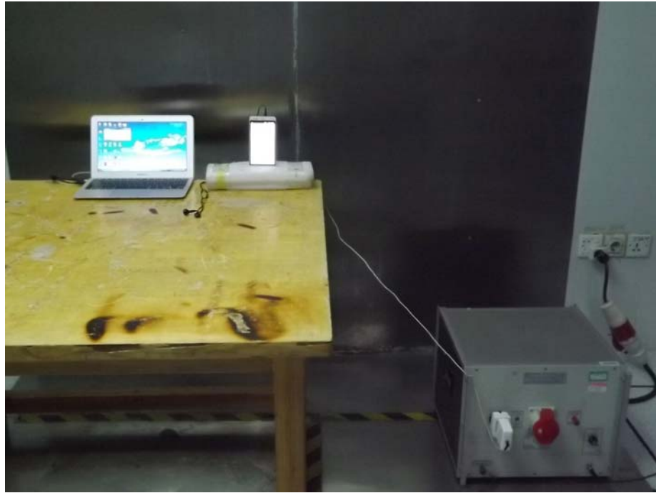
Photograph – Radiated Emission Test Setup for 30~1000MHz at Test Site 2#