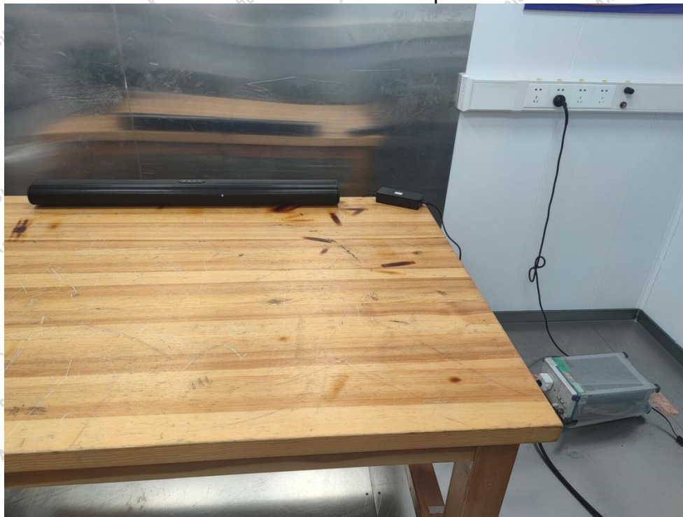
Radiation Emission Test (below 1GHz)

Adapter: CW2204000 Conducted Emission at AC power line