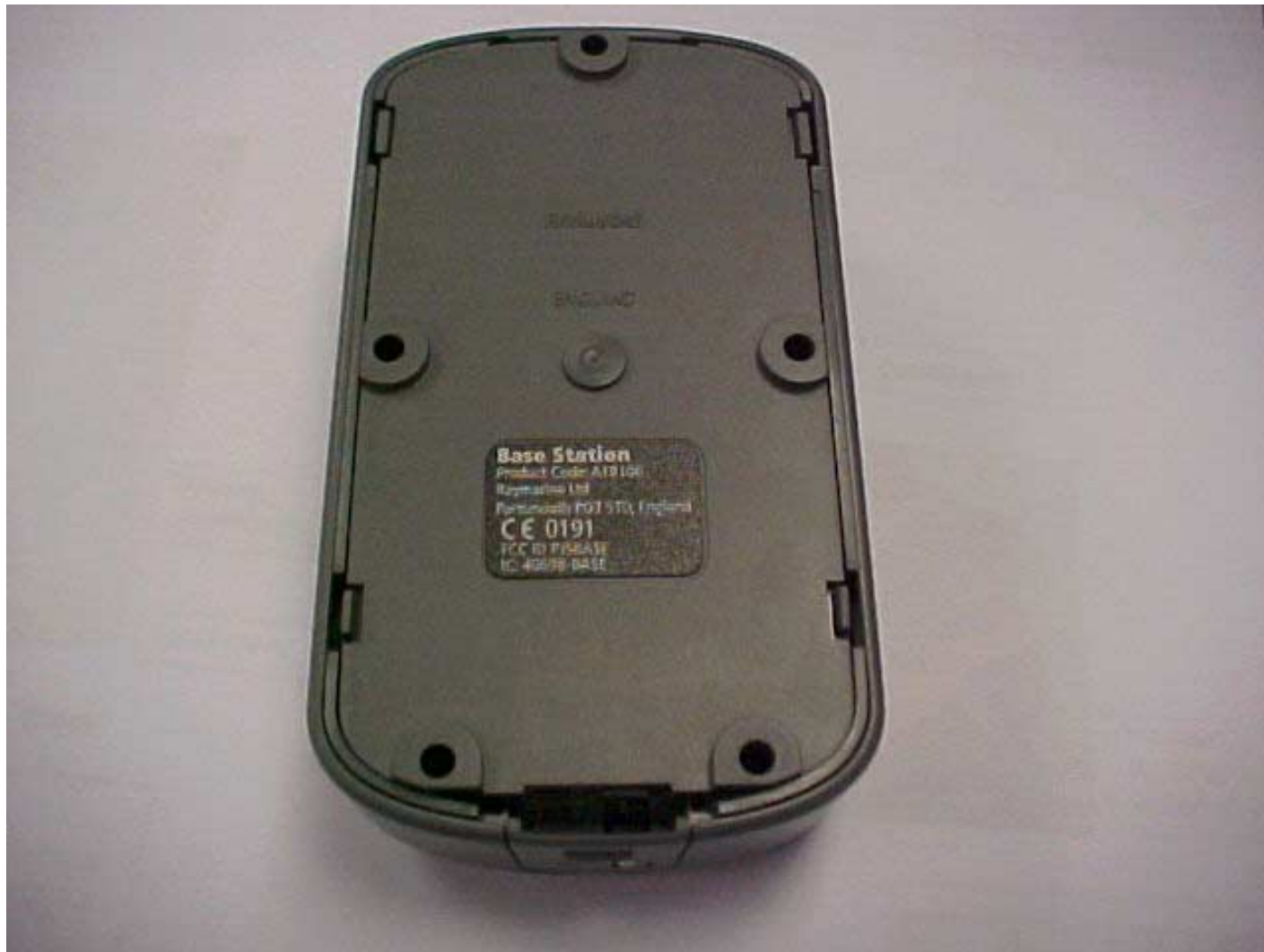
Base Station: FCC and IC Label location