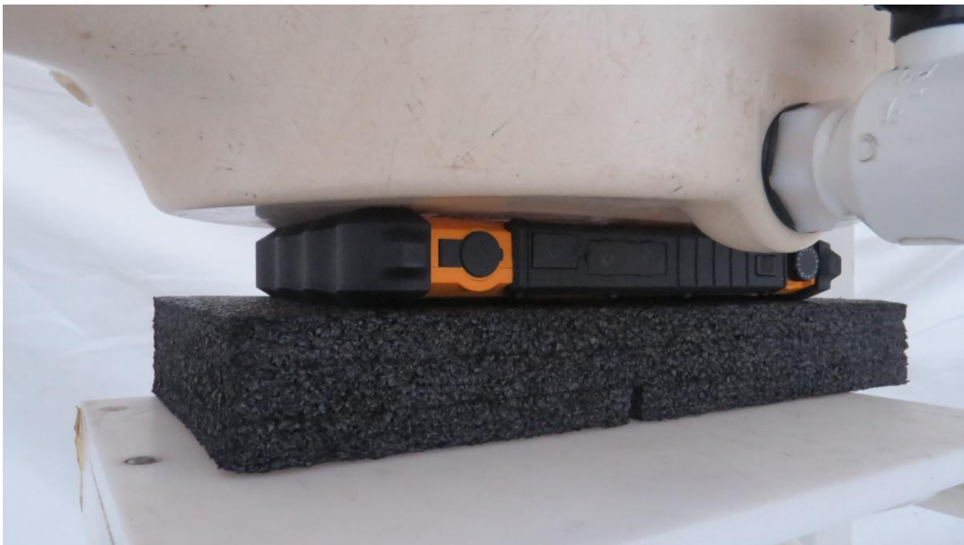
Picture 2: Front Side, the distance from handset to the bottom of the Phantom is 0mm