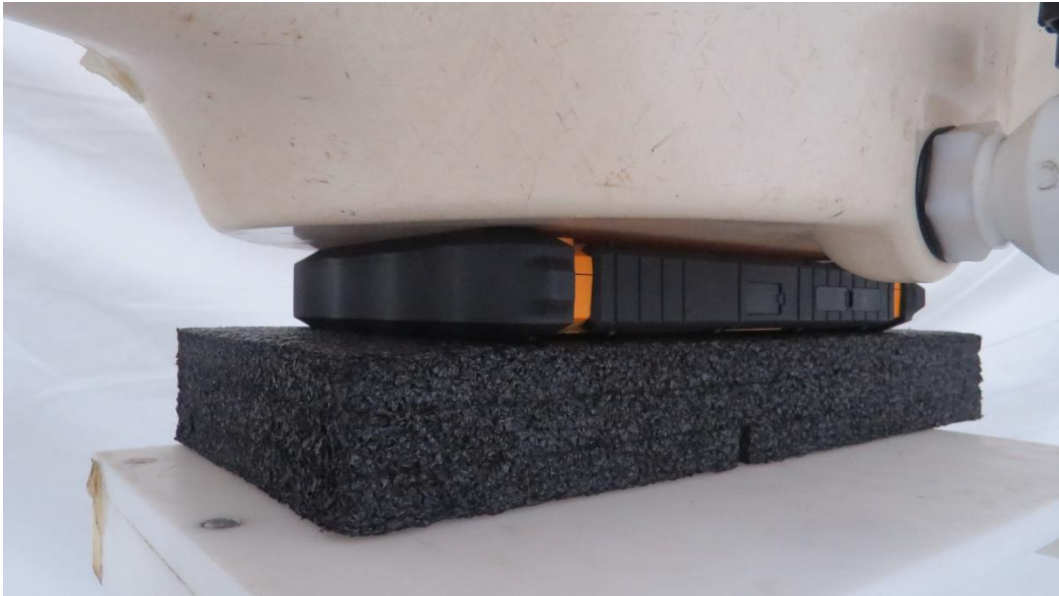
Picture 1: Back Side, the distance from handset to the bottom of the Phantom is 0mm