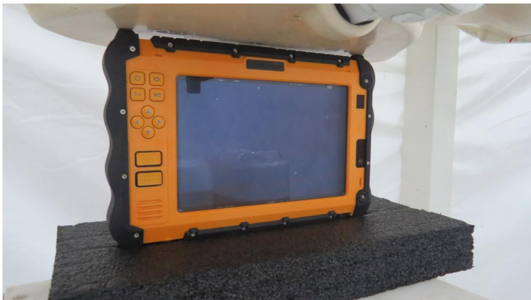
Picture 6: Bottom Side, the distance from handset to the bottom of the Phantom is 0mm