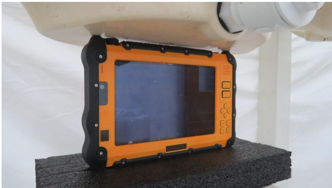
Picture 5: Top Side, the distance from handset to the bottom of the Phantom is 0mm