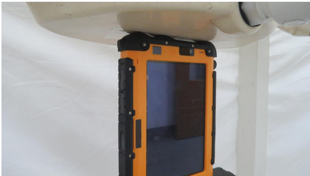
Picture 3: Left Side, the distance from handset to the bottom of the Phantom is 0mm