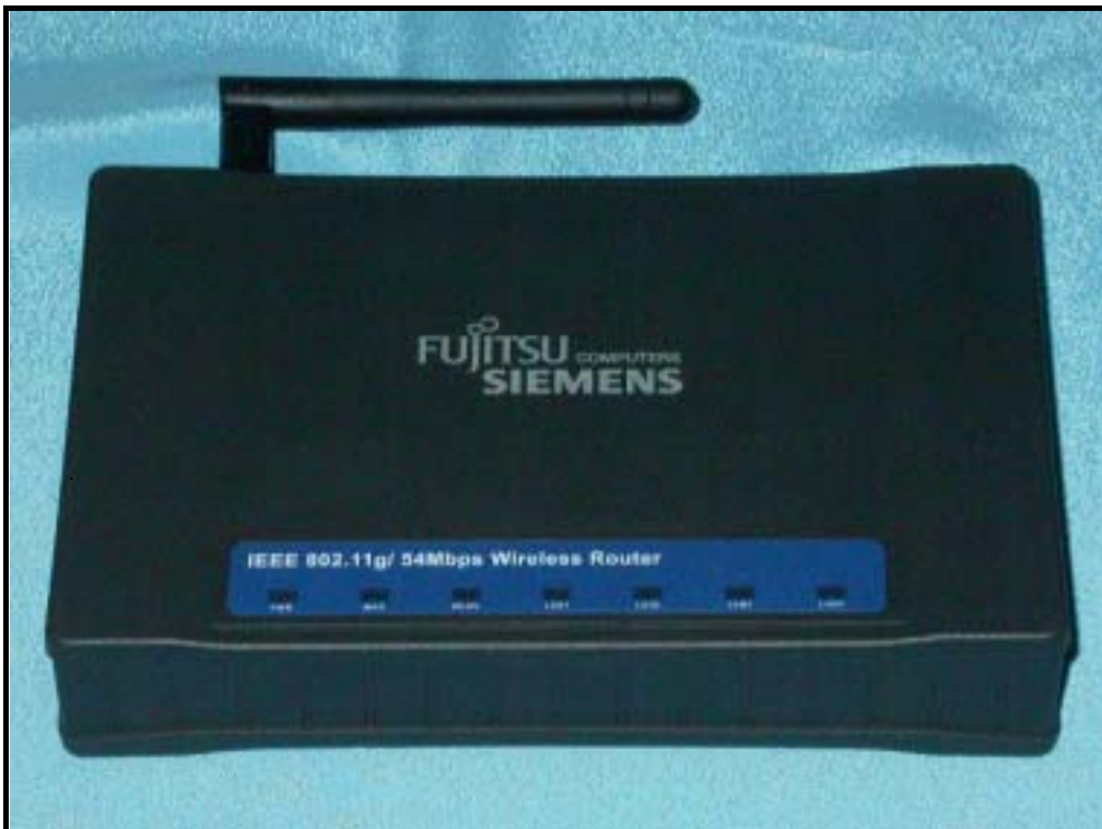
XG-2000 black case (Before)

(2)The difference is change of the case.