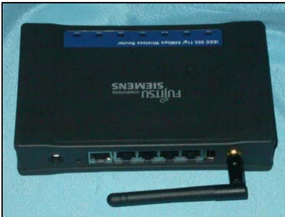
XG-2000 black case (Before)