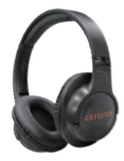
User Manual ITEM# AI9006-BLK