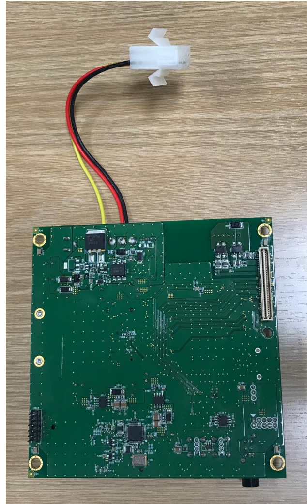
Power PCB (Reverse side)