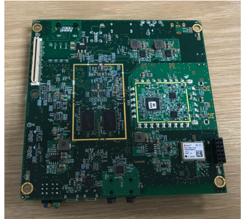
Main PCB (Reverse side)