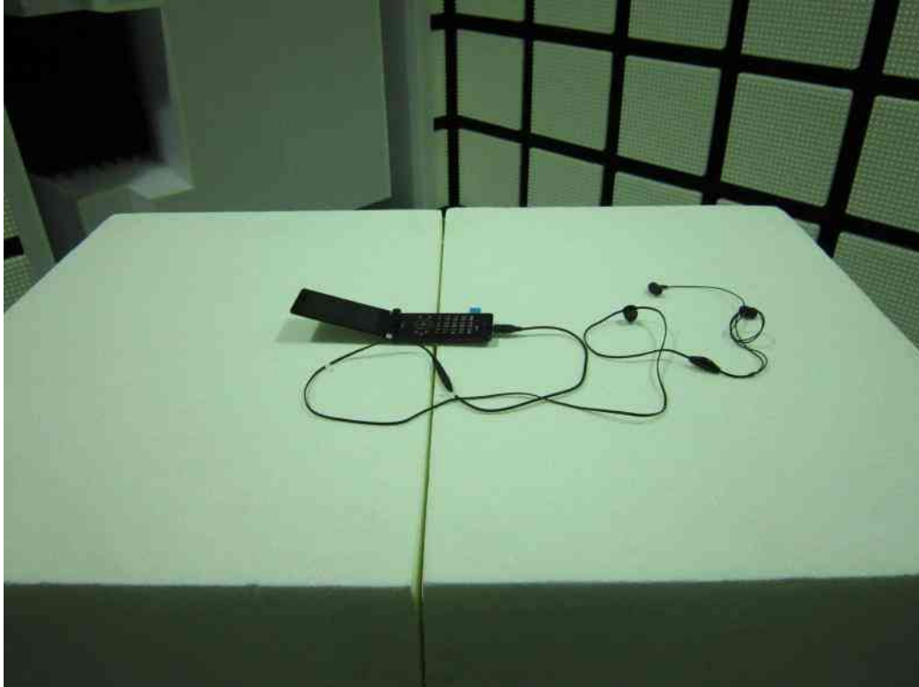
– X-axis –