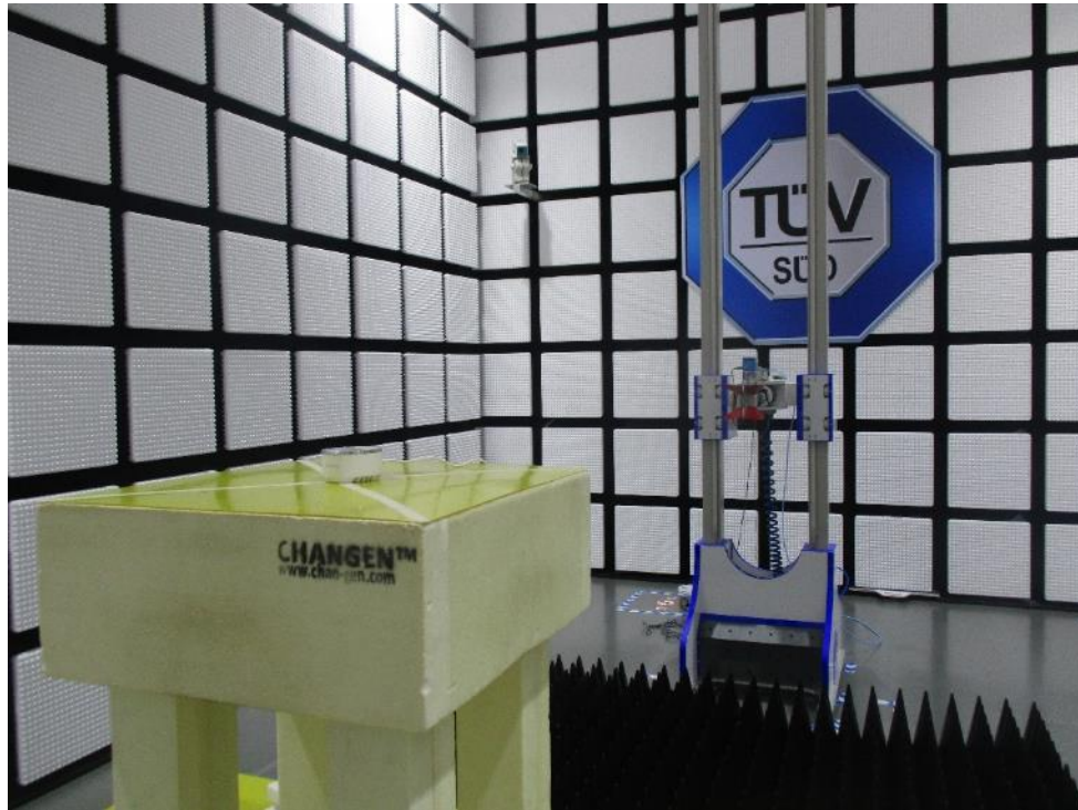
Radiated Emission Test 18GHz-40GHz