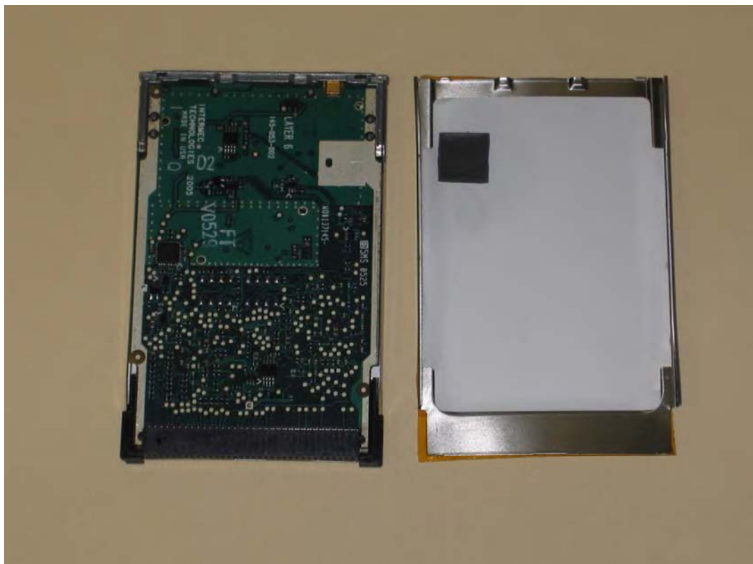
IM4 Card with Bottom Shield Removed