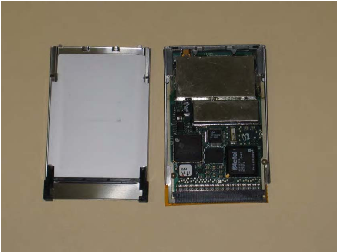
IM4 Card with Top Shield Removed