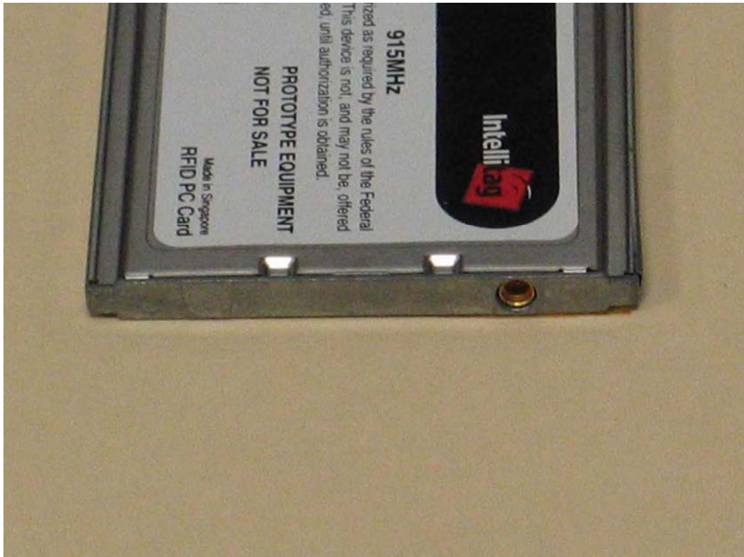
End of IM4 Card with RF Connector