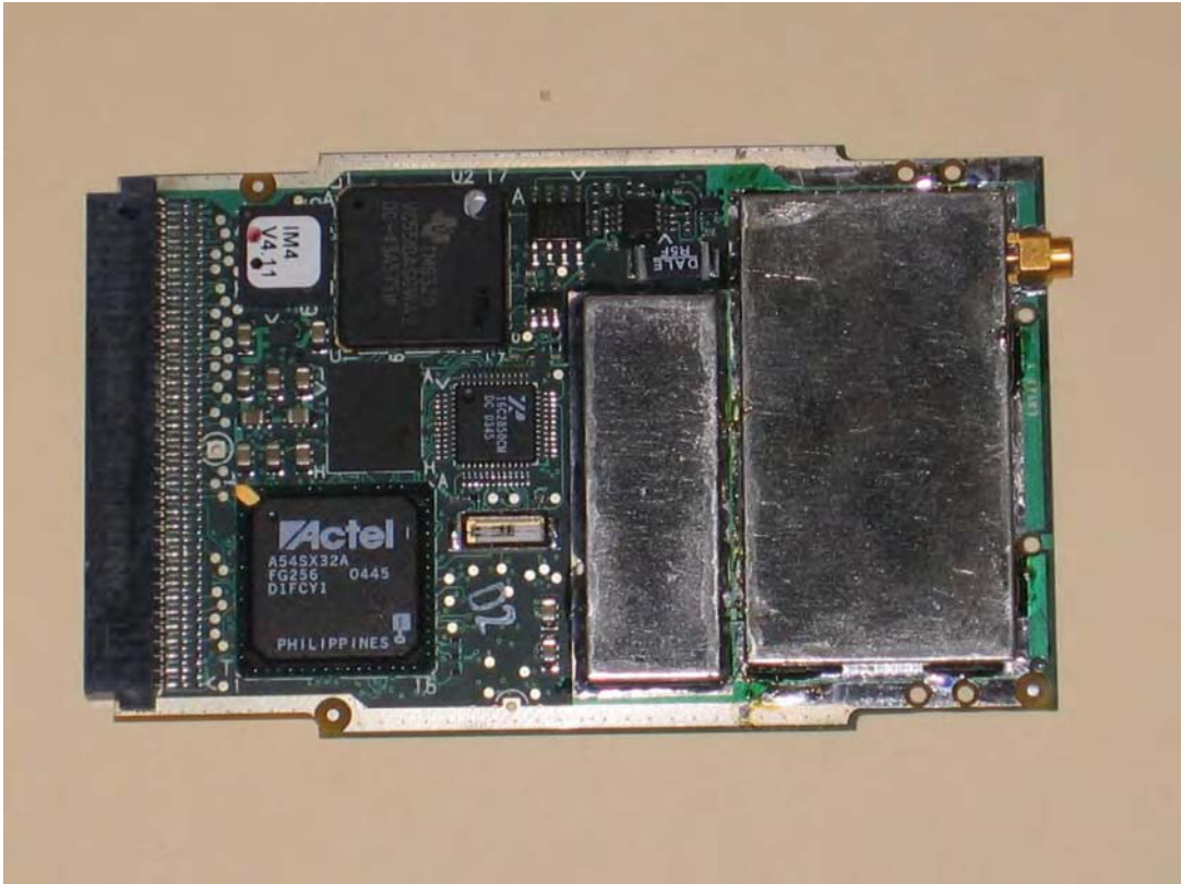
Top of IM4 PCB with Shields Installed