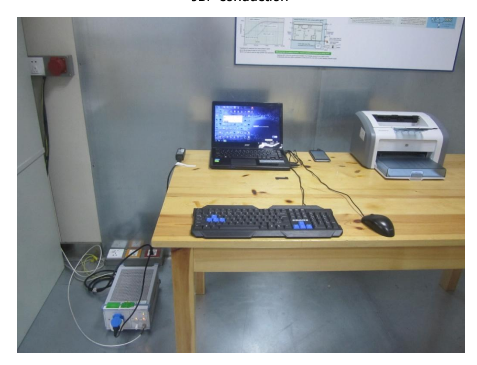
JBP radiation L