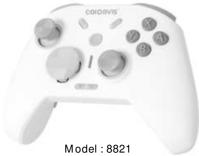
Model : 8821