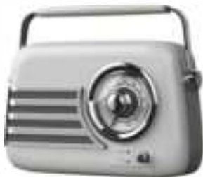
Operation Manual TB-RET2